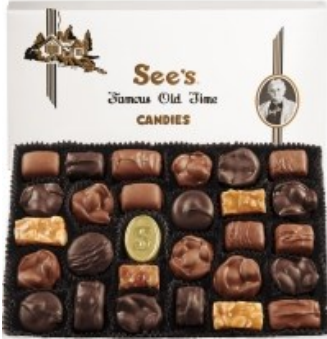
Nuts and Chews (1 Lb) $26.25