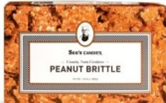
Peanut Brittle (1 Lb 8 oz) $26.75

Irresistible mix of nutty, chewy, crunchy and soft centers