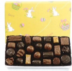
Assorted Chocolates Milk and dark chocolates. Delivered in seasonal wrap. 1 lb $21.00 #318