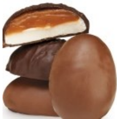
3.4 oz Marshmallow Egg