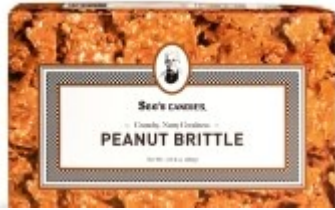
Peanut Brittle (1 Lb 8 oz) $26.75

Irresistible mix of nutty, chewy, crunchy and soft centers