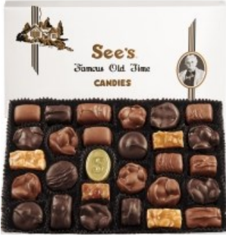
Nuts and Chews (1 Lb) $26.25