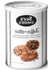
Toffee-ettes (1 Lb) $26.25