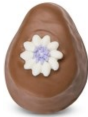
3 oz Peanut Butter