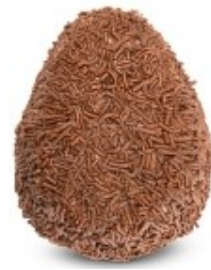
3 oz Bordeaux™