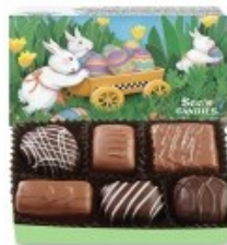
4 oz Egg Hunt Box $8.60