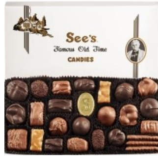
Assorted Chocolates (1 lb ) $26.25

Irresistible mix of nutty, chewy, crunchy and soft centers