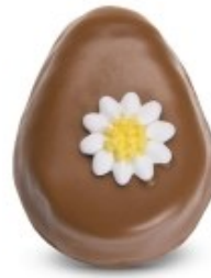
3 oz Chocolate Butter