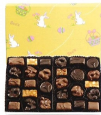
Nuts & Chews Yummy, crunchy and chewy. Delivered in seasonal wrap. 1 lb $21.00 #334