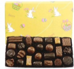
Assorted Chocolates Milk and dark decadence. Delivered in seasonal wrap. 1 lb $21.00 #318