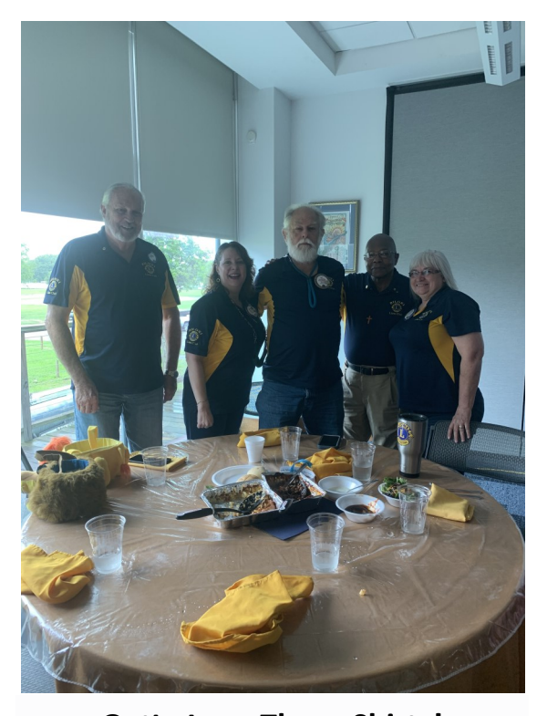
Gotta Love Those Shirts!

Go to seaandsuncamp.com or to the Facebook page Sea & Sun Camp Inc. to see all the fun in pictures