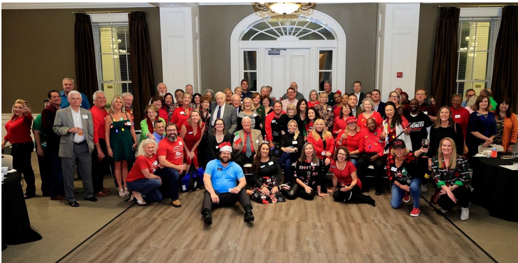
Below: Biloxi Lions Represent the Club at the Biloxi Bay Area Chamber of Commerce's Christmas Party. Can you find them?