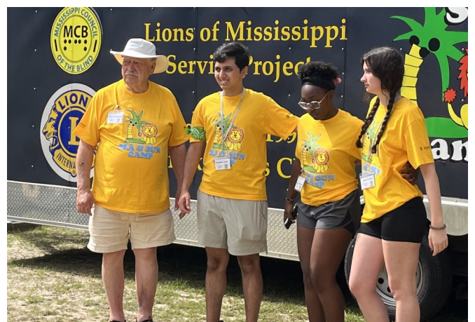
Madison Leo Club stepped up to the plate again this year to volunteer to give the campers an unique experience.