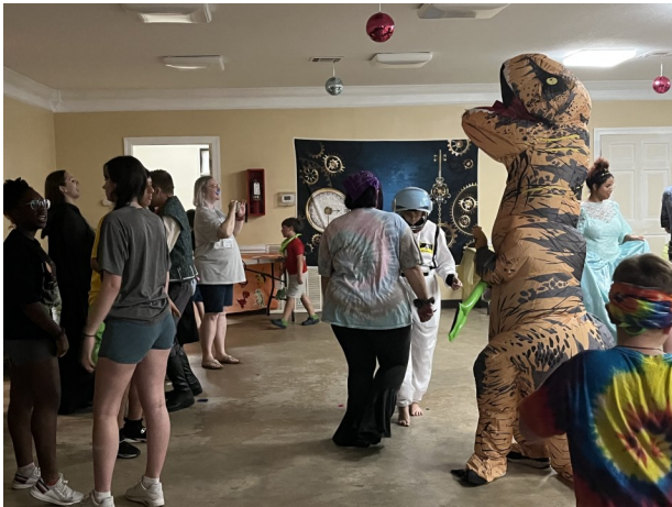
Friday night dance party. Yes, that is a Dinosaur dancing with an astronaut. Time travel can make anything possible!