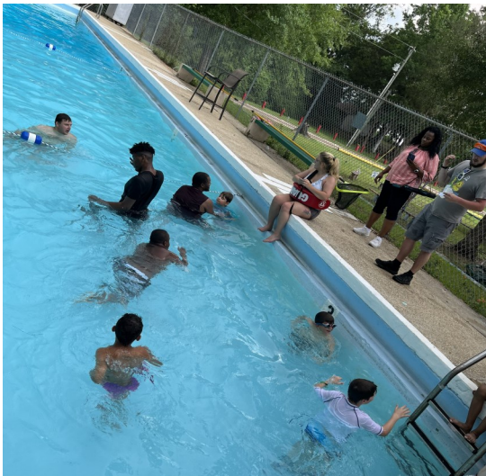
Boy's Pride groups enjoying a swim prior to the Severe weather that moved in Saturday afternoon