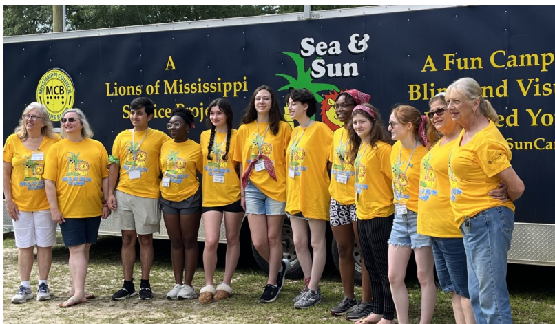
1st time Tupelo Leo Club volunteers were such a great help and they had an awesome time with the campers.