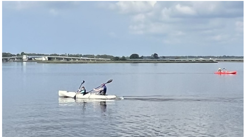
Saturday morning kayaking. The water was perfect, smooth as glass!