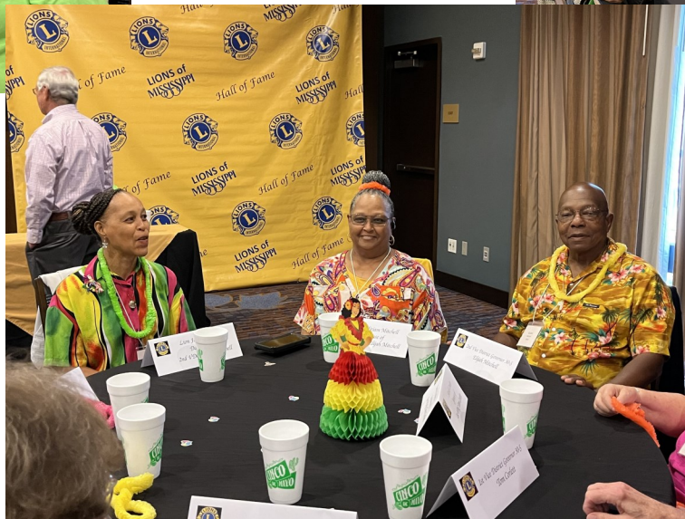
Remember Biloxi will be hosting the 2024 Lions of MS State Convention...and we are Over the Moon for Our 100th...