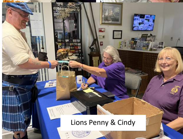
Lions Penny & Cindy