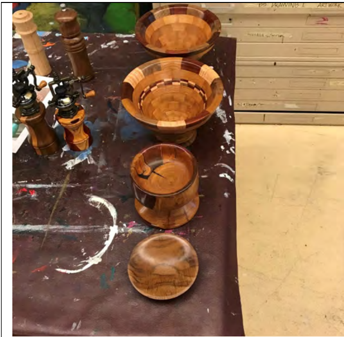
Nice Member Gallery Last Month