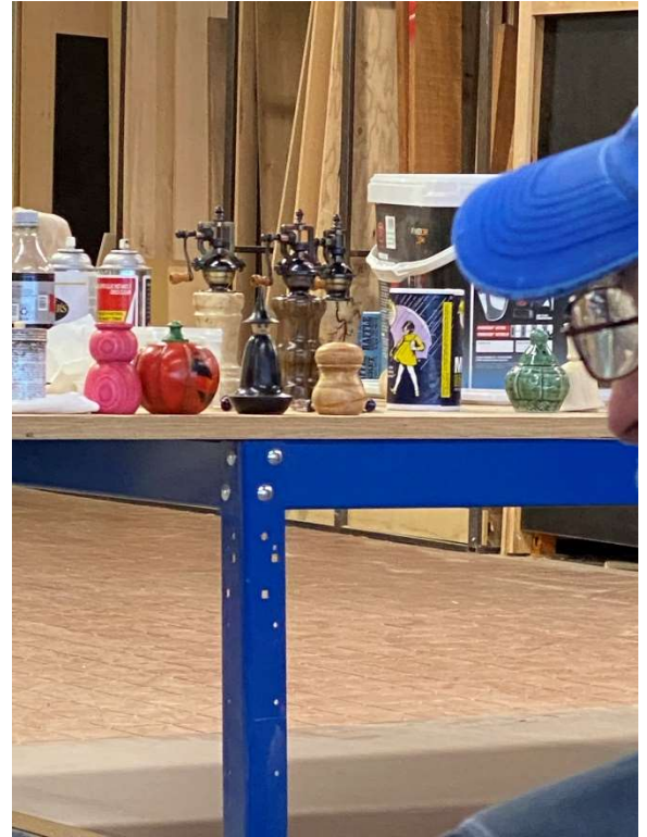
Examples of shakers you can make.