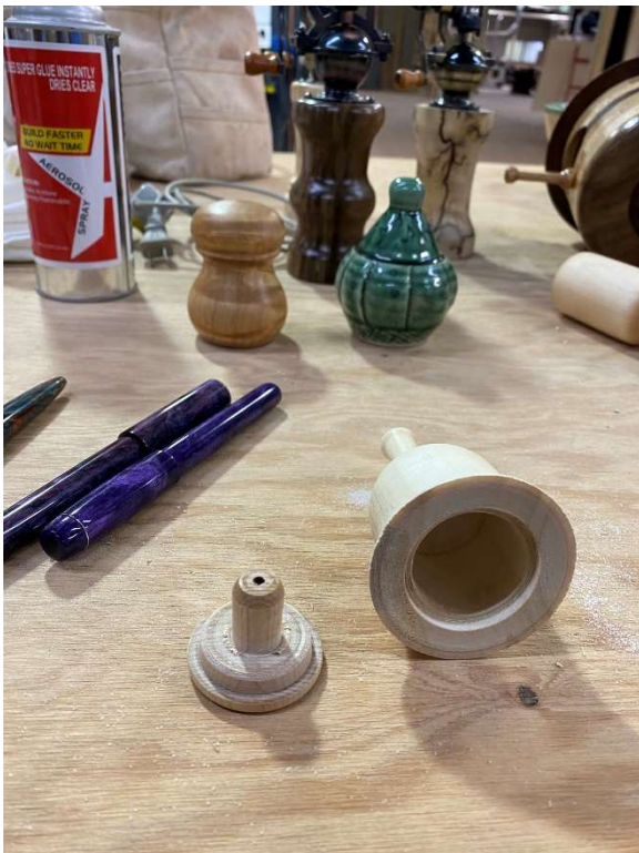
Pepper grinders by Al Testa