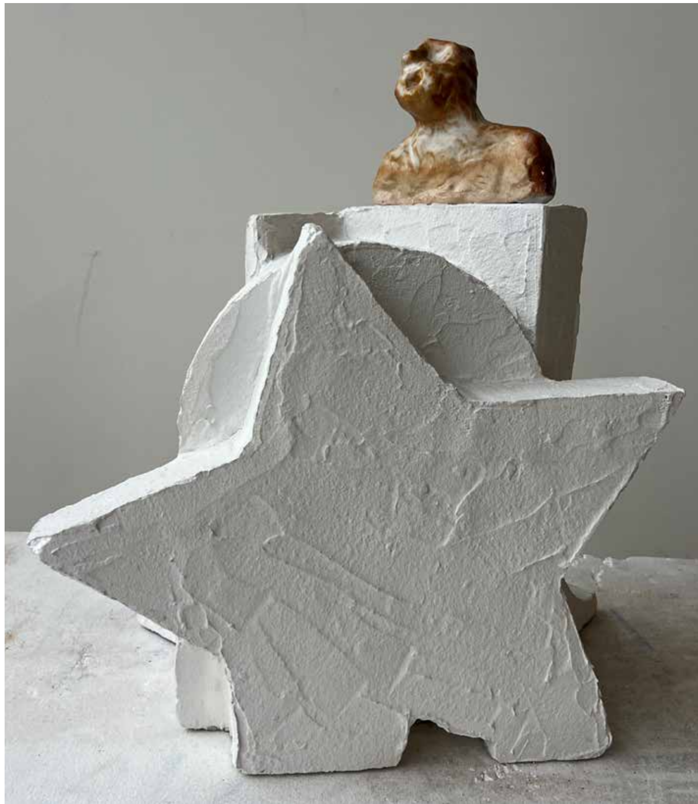
Nina Sanadze Artwork Interrupted: Stargazing, 2023. Fired stoneware, polystyrene, cement, hydrostone. 58cm x 48cm x 52cm Artwork #10 $1300