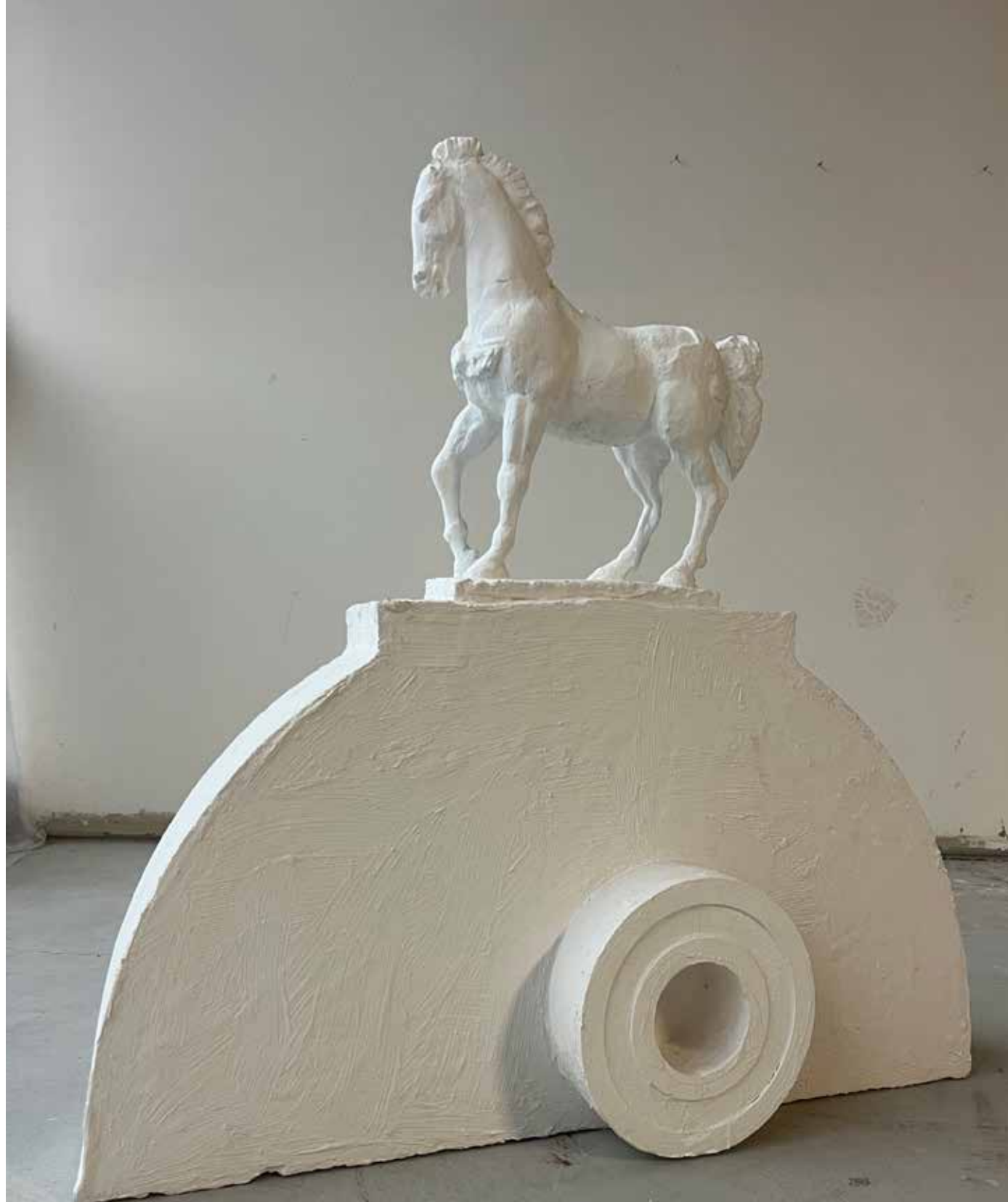
Nina Sanadze Artwork Interrupted: Nursery , 2023. Fired stoneware, polystyrene, resin, cement, hydrostone. 112cm x 120cm x 52cm Artwork #15 $3500