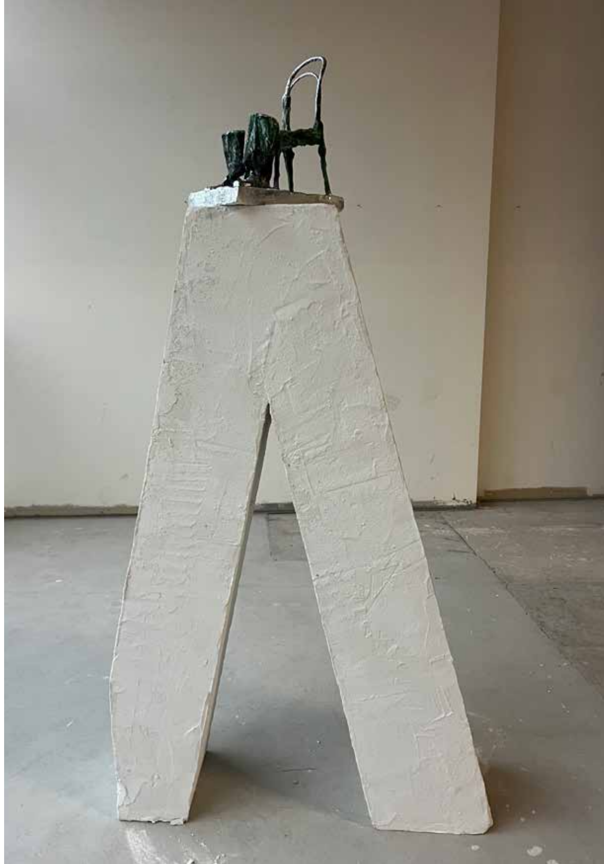
Nina Sanadze Artwork Interrupted: Empty Throne with a Capital A , 2023. Polystyrene, cement, concrete, hydrostone, resin, enamel paint. 36cm x 22cm x 31cm + plinth 168cm x 90cm x 31cm Artwork #4 $3500