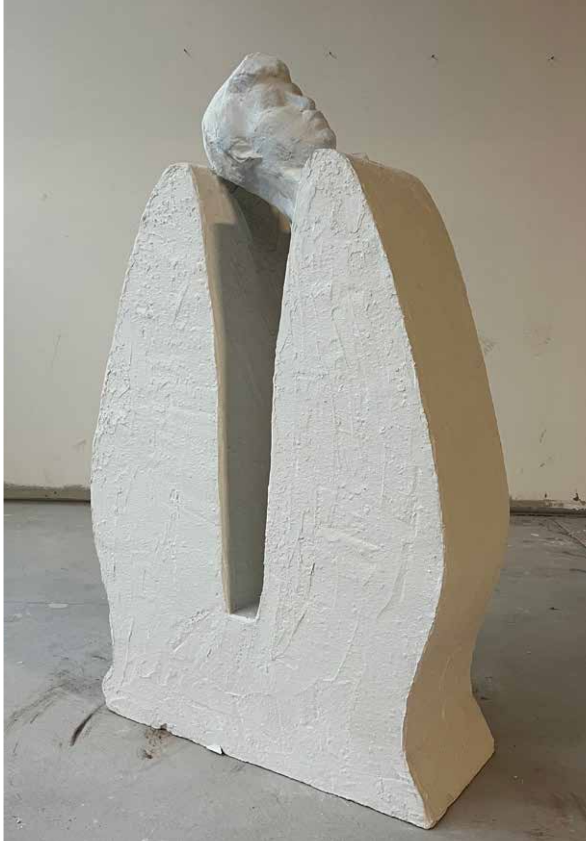
Nina Sanadze Artwork Interrupted: Bunny , 2023. Polystyrene, cement, hydrostone, resin, enamel paint. 133cm x 77cm x 30cm Artwork #20 $2200