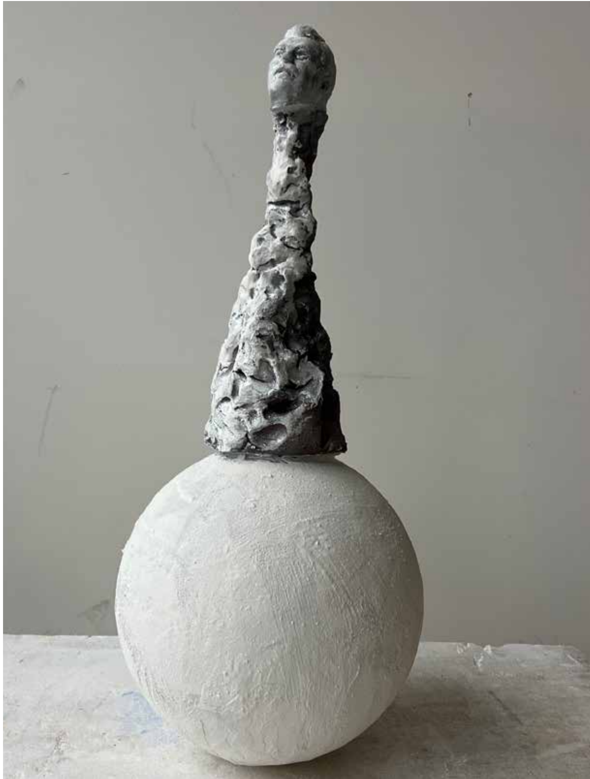
Nina Sanadze Artwork Interrupted: Stalin Pile, 2023. Fired stoneware, polystyrene, concrete, hydrostone, resin, enamel paint. 89cm x 33cm x 33cm Artwork #5 $1500