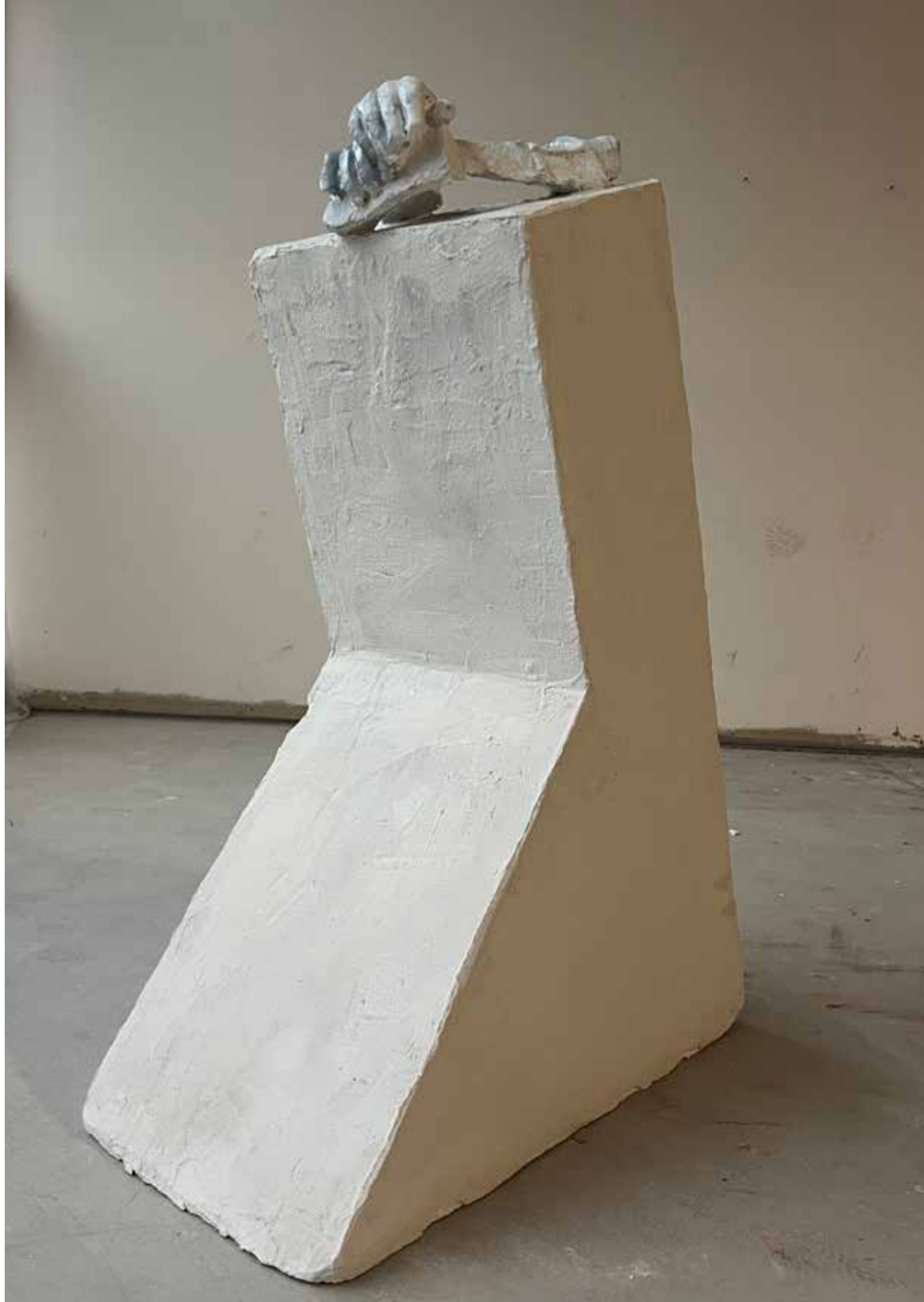
Nina Sanadze Artwork Interrupted: Prayer , 2023. Polystyrene, cement, hydrostone, resin, enamel paint. 125cm x 44cm x 99cm Artwork #18 $2200