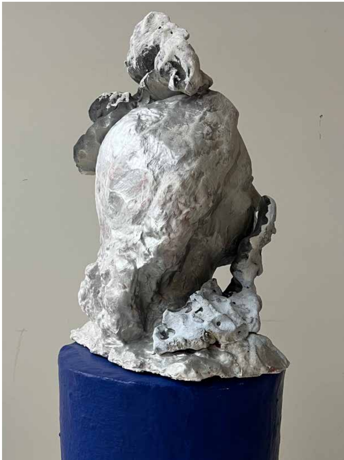
Nina Sanadze Artwork Interrupted: River of Tears Turned to Stone, 2023. Fired stoneware, cement, hydrostone, resin, acrylic paint, enamel paint. 53cm x 42cm x 26cm + plinth 46cm x 36cm x 36cm Artwork #14 $3500