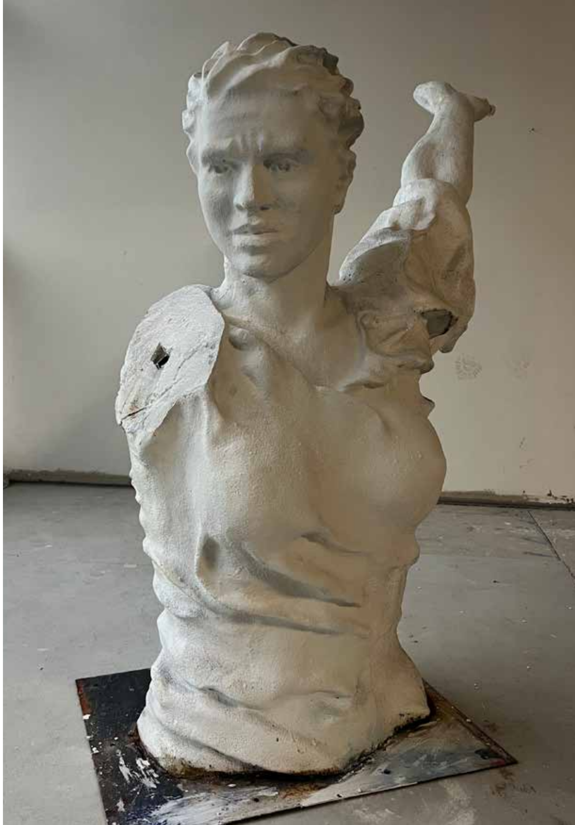
Nina Sanadze Artwork Interrupted: Call to Peace Afterlife , 2023. Polystyrene, cement, acrylic paint, steel. 160cm x 180cm x 130cm Artwork #25 $5000