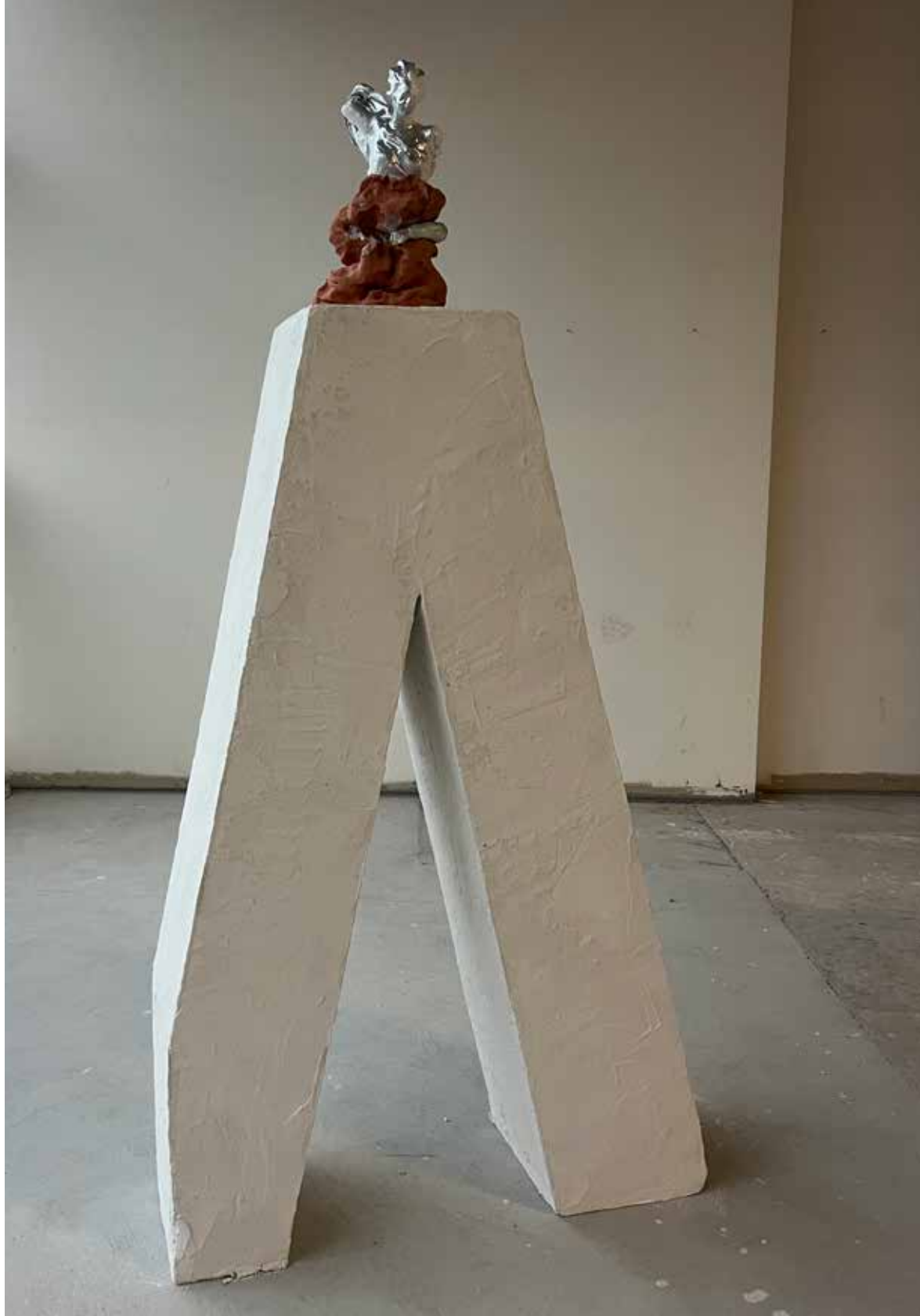
Nina Sanadze Artwork Interrupted: Call to Peace with a Capital A , 2023. Polystyrene, cement, hydrostone, resin, enamel paint. 37cm x 20cm x 12cm + plinth 168cm x 90cm x 31cm Artwork #3 $3500