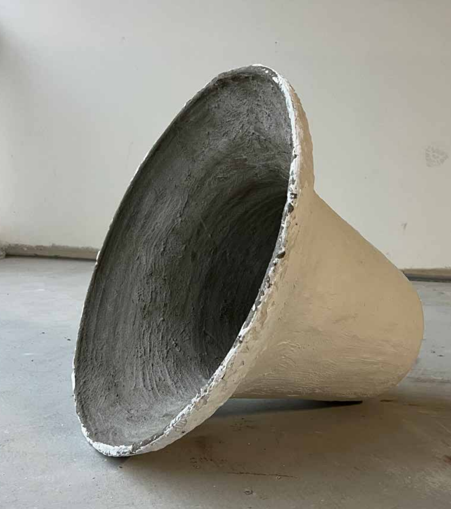
Nina Sanadze Artwork Interrupted: 7 October Bell, 2023. Fired stoneware coated with concrete and hydrostone. 60cm x 70cm x 70cm Artwork #11 $4000