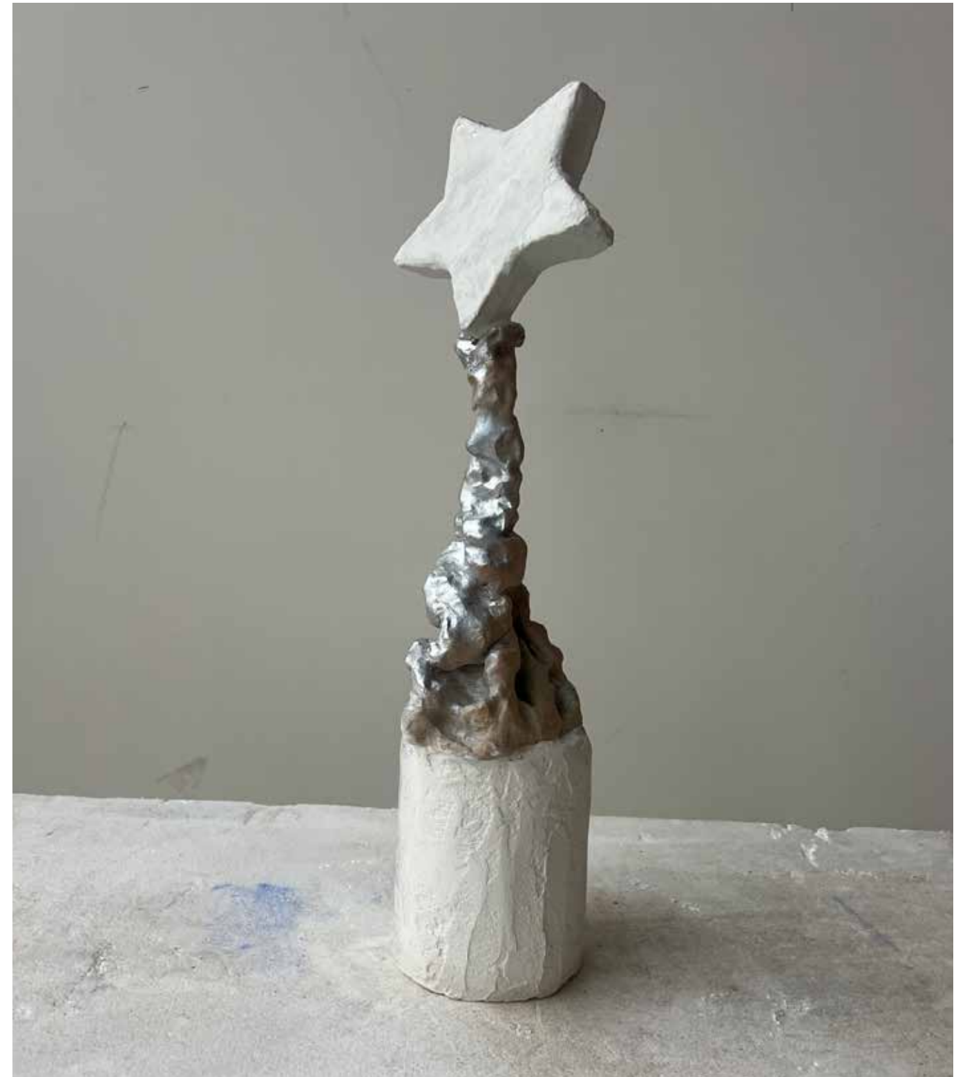
Nina Sanadze Artwork Interrupted: Star , 2023. Fired stoneware, polystyrene, cement, enamel paint. 59cm x 12cm x 12cm Artwork #1 $600

Funds raised from this show will directly support the upcoming landmark 7 October exhibition at Goldstone Gallery. Prices have been reduced by over 25% to support this initiative.