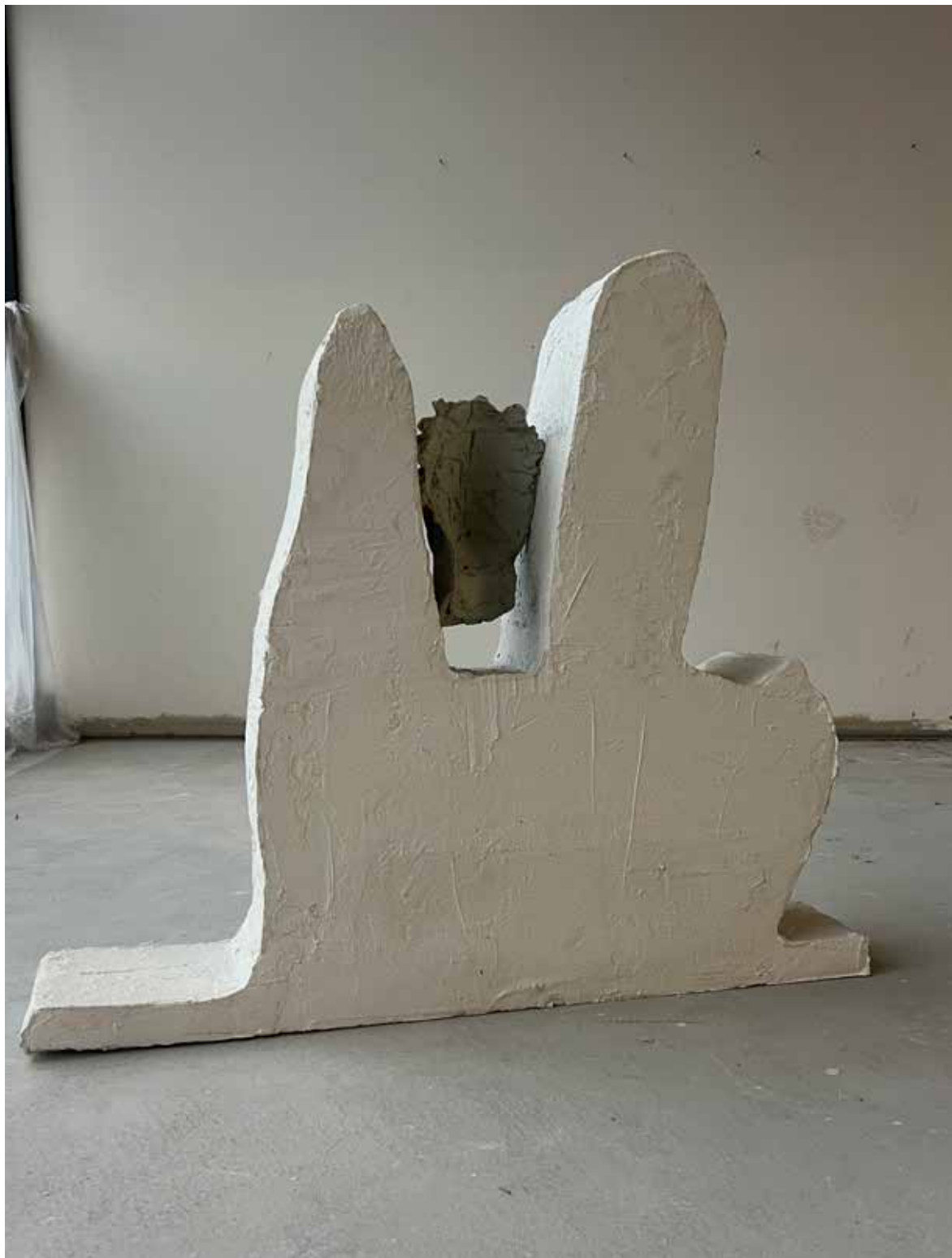
Nina Sanadze Artwork Interrupted: Osmosis , 2023. Polystyrene, cement, hydrostone, acrylic paint, enamel paint. 90cm x 21cm x 101cm Artwork #17 $1500