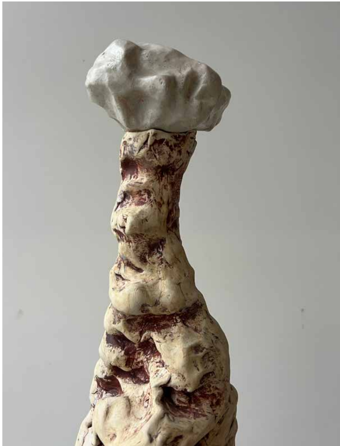
Nina Sanadze Artwork Interrupted: Fist , 2023. Fired stoneware, polystyrene, cement, hydrostone, acrylic paint. 90cm x 33cm x 33cm + plinth 46cm x 36cm x 36cm Artwork #12 $2200