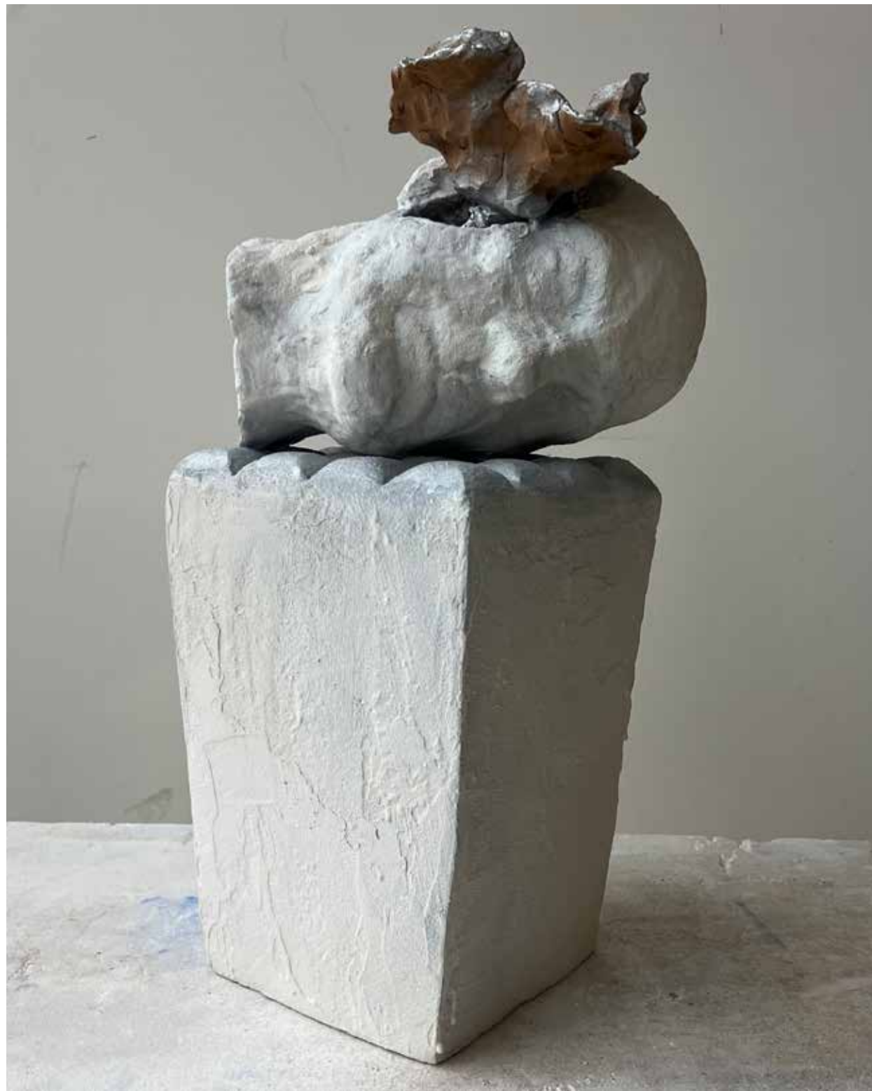
Nina Sanadze Artwork Interrupted: Fallen Artist, 2023. Fired stoneware, polystyrene, cement, hydrostone, resin, enamel paint. 63cm x 33cm x 33cm Artwork #7 $2200