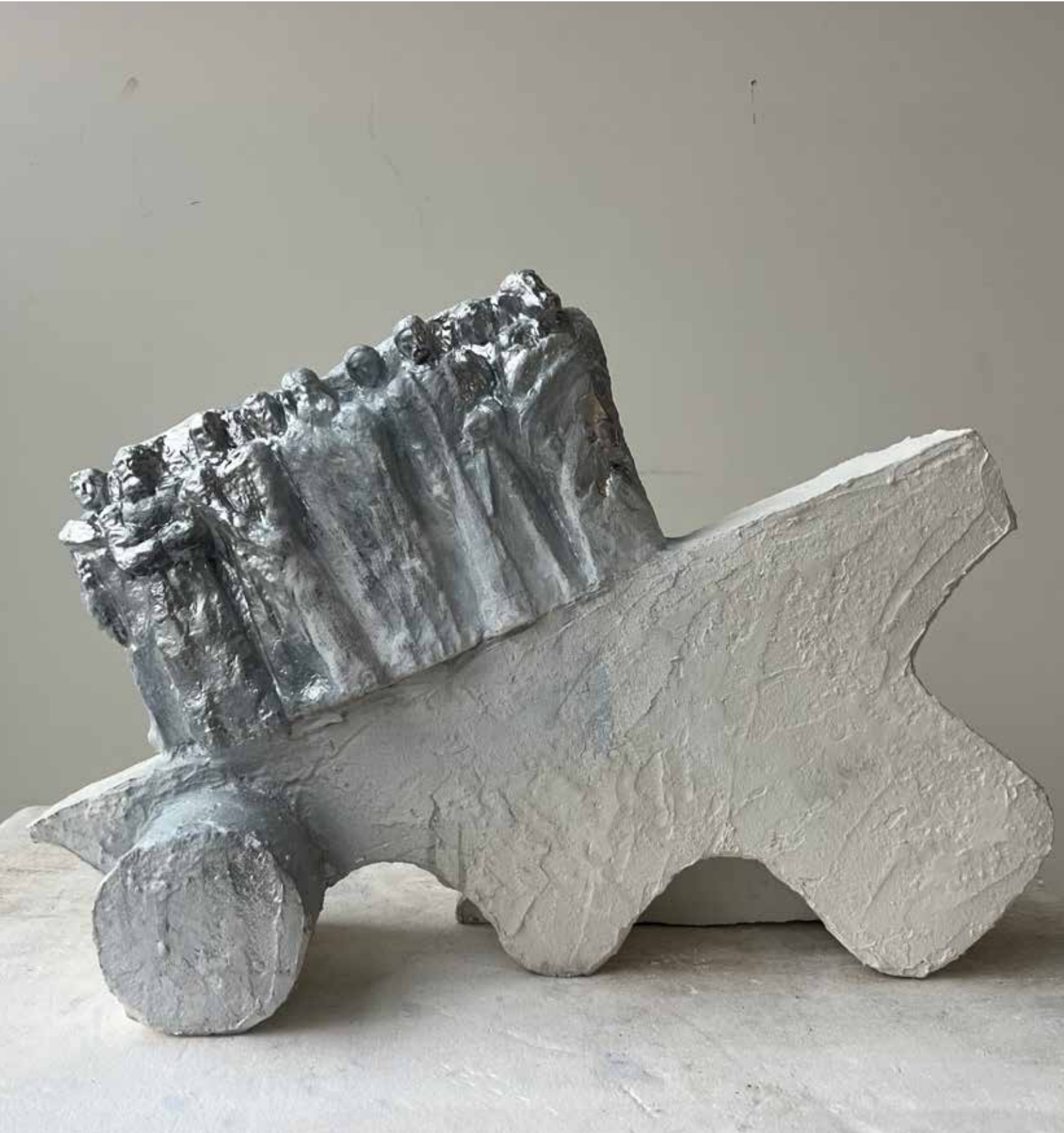
Nina Sanadze Artwork Interrupted: Minyan , 2023. Polystyrene, cement, hydrostone, resin, enamel paint. 50cm x 70cm x 32cm Artwork #13 $2200