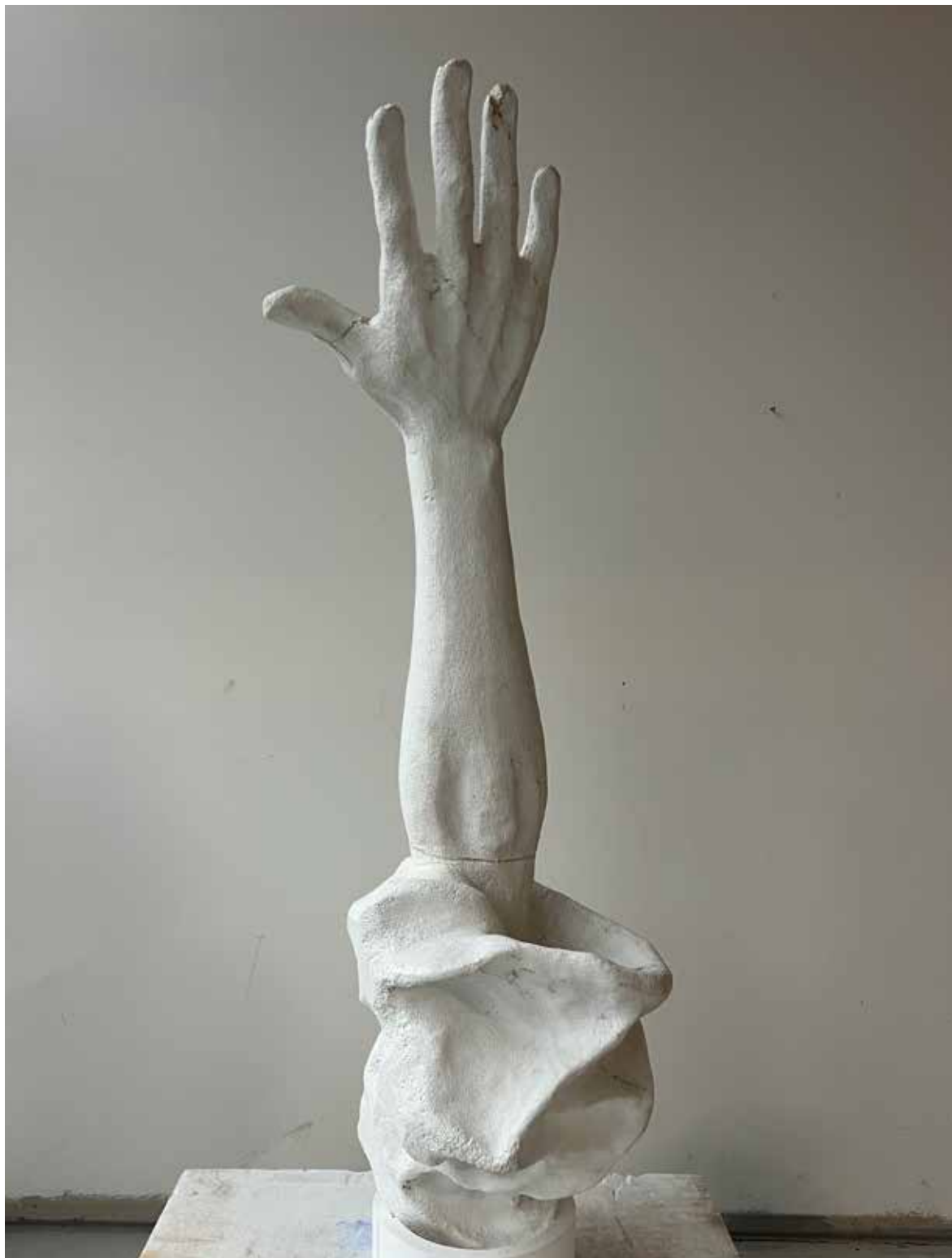
Nina Sanadze Artwork Interrupted: Hand , 2023. Polystyrene, cement, acrylic paint, steel. 160cm x 46cm x 52cm Artwork #24 $1000