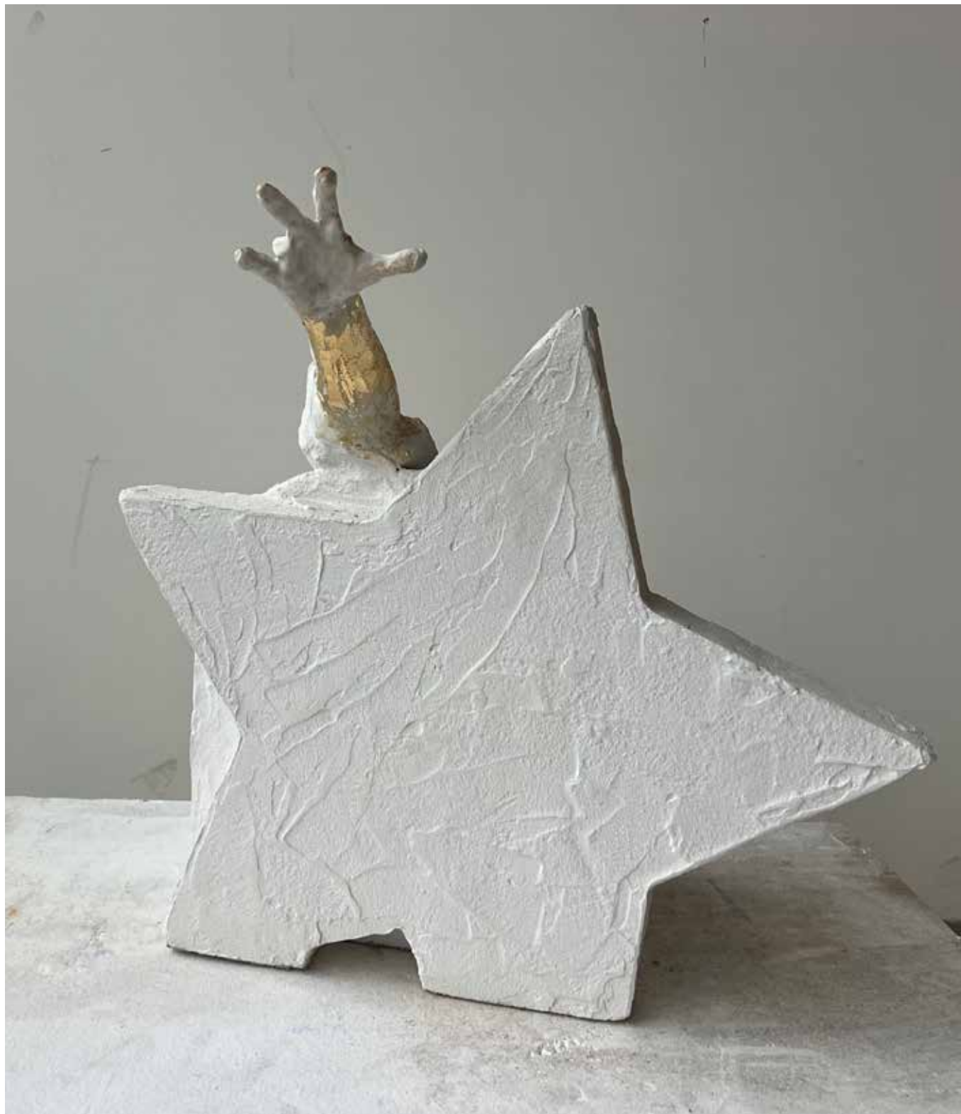
Nina Sanadze Artwork Interrupted: Fallen Star , 2023. Polystyrene, cement, hydrostone, resin, gold leaf. 60cm x 59cm x 24cm Artwork #6 $1300