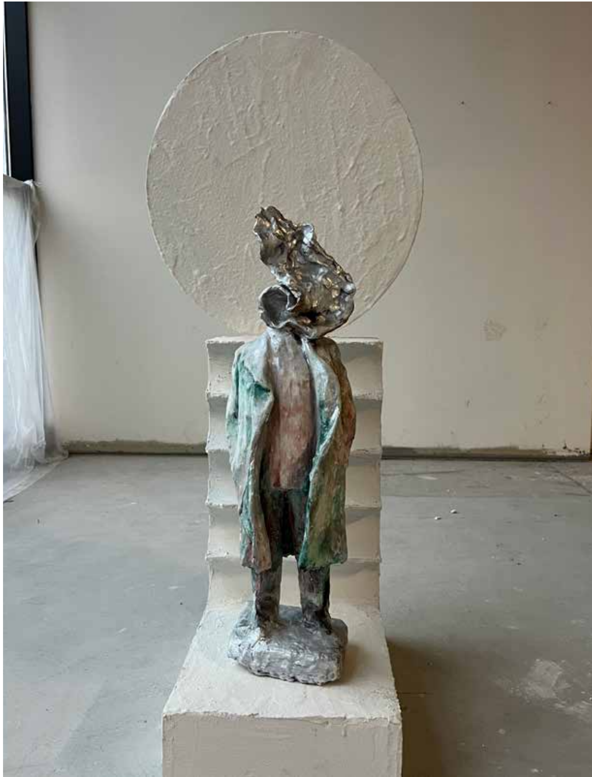
Nina Sanadze Artwork Interrupted: Stalin Ghost, 2023. Fired stoneware, polystyrene, cement, hydrostone, resin, acrylic paint, enamel paint. 80cm x 26cm x 28cm + plinth 133cm x 60cm x 63cm Artwork #8 $3500