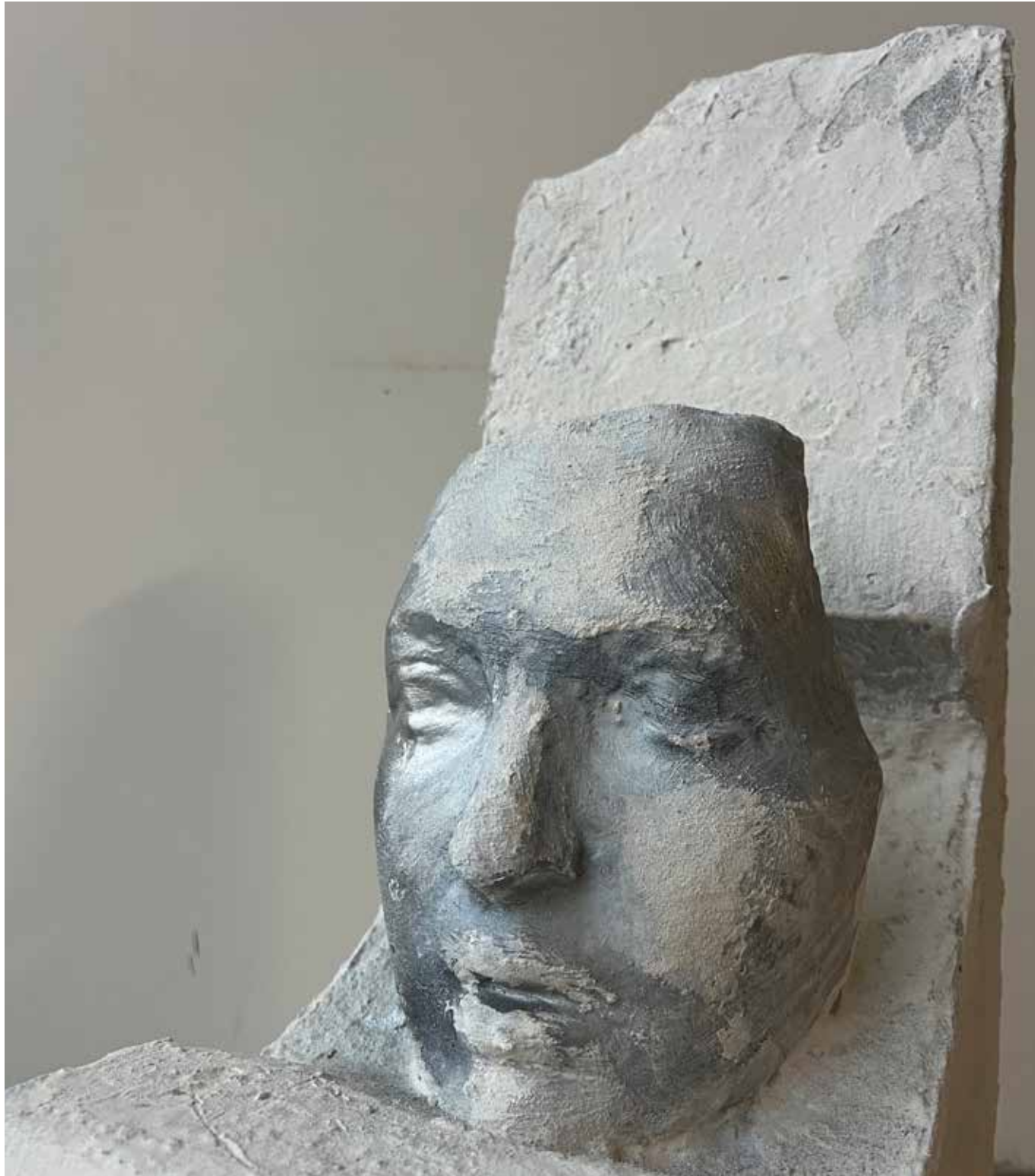
Nina Sanadze Artwork Interrupted: Morner , 2023. Polystyrene, cement, hydrostone, resin, enamel paint. 80cm x 21cm x 62cm Artwork #19 $1200