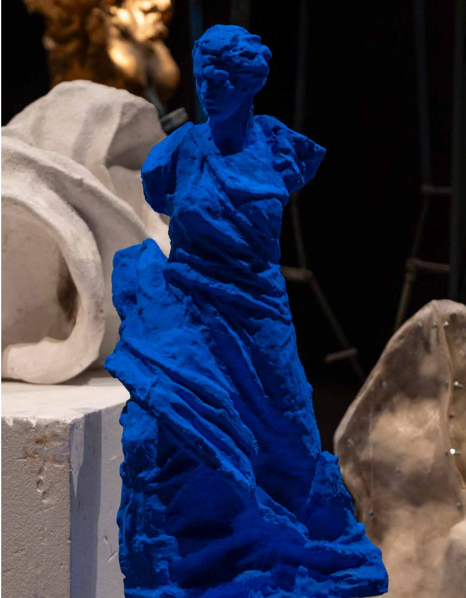
Nina Sanadze Artwork Interrupted: Call to Peace Blue Test (Valentin Topuridze replica), 2023. Hydrostone, pigment. 80cm x 52cm x 45cm Artwork #22 $1500