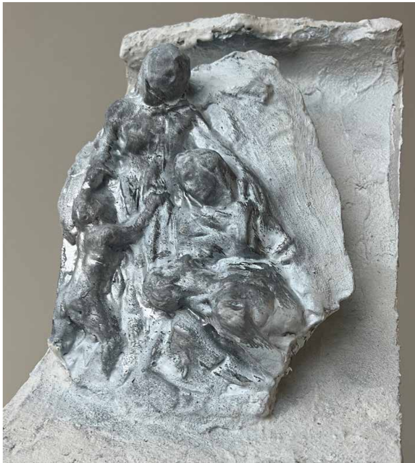
Nina Sanadze Artwork Interrupted: Pieta , 2023. Fired stoneware, cement, hydrostone, resin, acrylic paint, enamel paint. 82cm x 21cm x 59cm Artwork #16 $2200