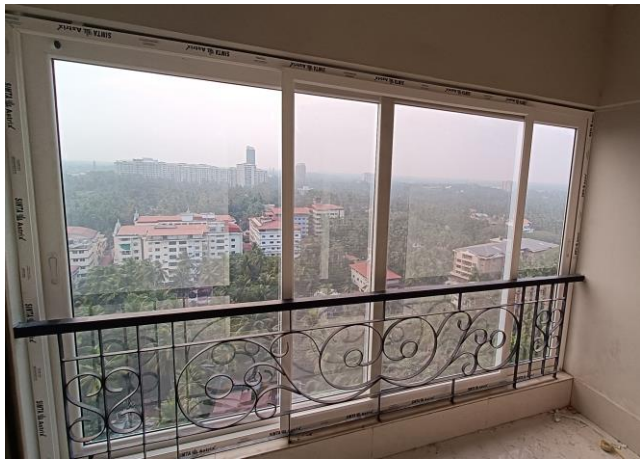
uPVC window solution