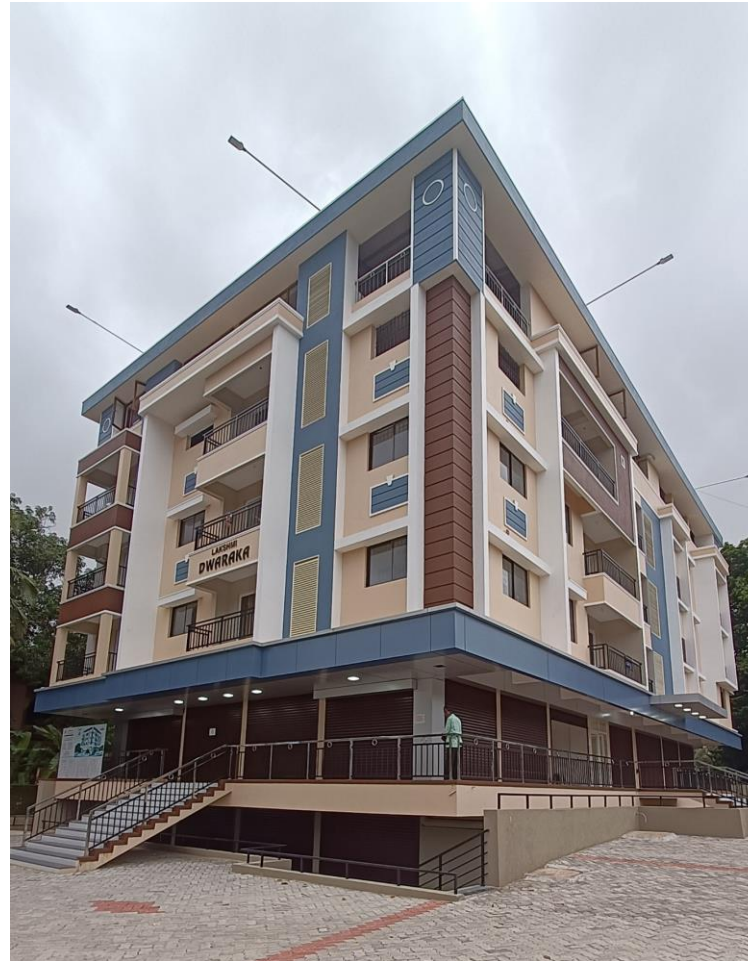
Lakshmi Dwaraka- Malpe