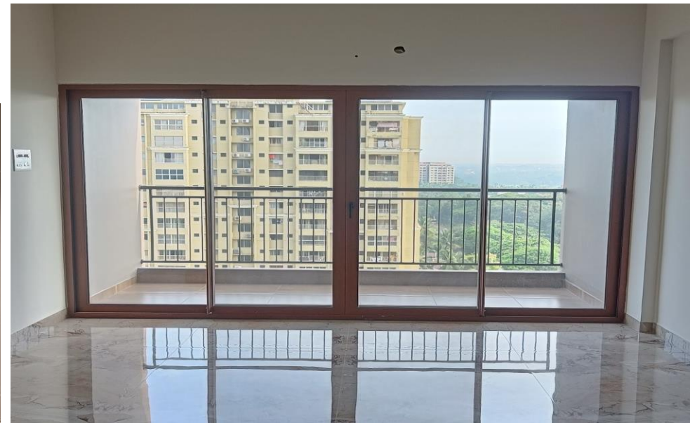
Wooden coated aluminum