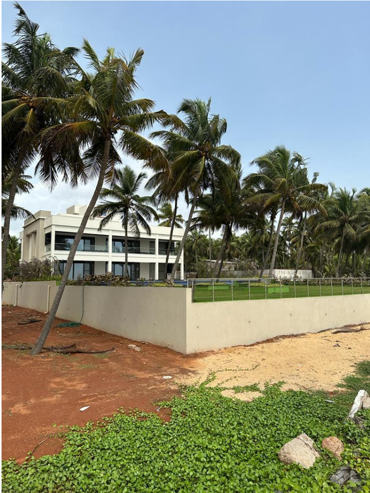
Mandavi - Malpe