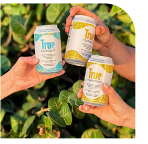
ASK ABOUT A FREE SAMPLE

The "Less Stress, More Focus" add-on features the Peace and Focus Super Patch, designed to help you manage stress and enhance mental clarity. The Peace Super Patch utilizes neurotech technology to promote a sense of calm and reduce anxiety, making it easier to handle highpressure situations. The Focus Super Patch sharpens concentration and improves cognitive function, ensuring you stay alert and efficient throughout your shift. These patches are easy to apply, discreet, and provide continuous support