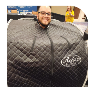
DISCOUNT CODE: PWR100