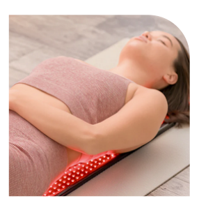
DISCOUNT CODE: PWR200FF

Enhance Law Enforcement Performance with B3 BFR Bands: A Proven Solution for Strength, Endurance, and Recovery. Supported by rigorous safety studies, these bands offer a secure and effective approach to improving strength, endurance, and injury recovery. Their easyto-use design and cost-effective pricing make B3 BFR Bands accessible for all, proving to be an essential asset for boosting physical fitness and operational readiness on the job.