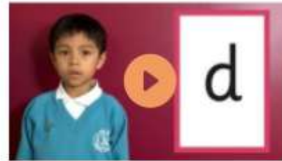
Phase 2 sounds taught in Reception Autumn 1