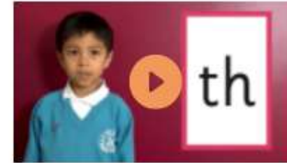
Phase 2 sounds taught in Reception Autumn 2