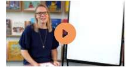
How we teach blending