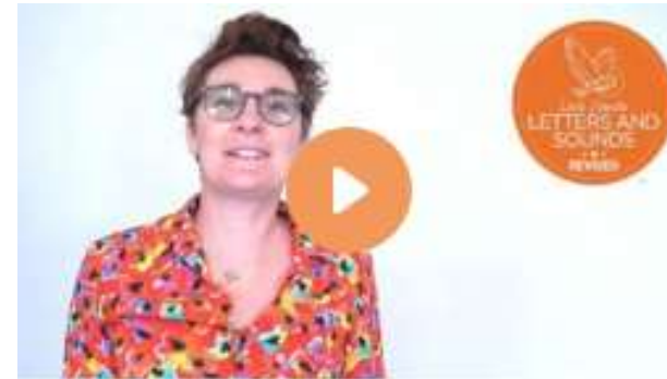
How to say Phase 5 sounds

https://www.littlewandlelettersandsounds.org.uk/resources/for-parents/