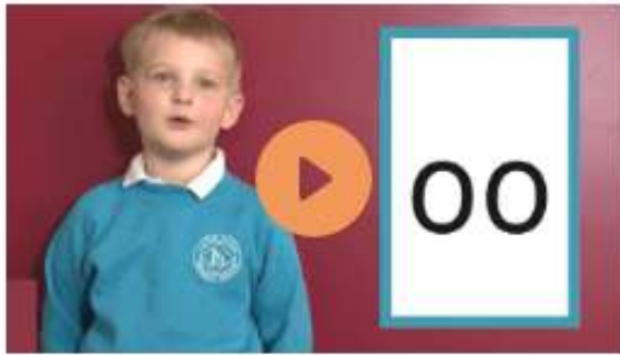
Phase 3 sounds taught in Reception Spring 1

https://www.littlewandlelettersandsounds.org.uk/resources/for-parents/