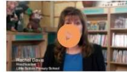
How we teach tricky words