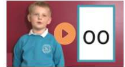
Phase 3 sounds taught in Reception Spring 1

We're teaching every child to read with Little Wandle Letters and Sounds Revised A complete SSP validated by the Department for Education