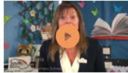
A quick guide to alien words