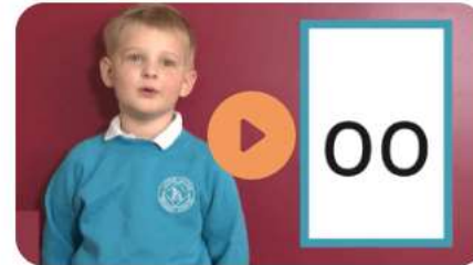
Phase 3 sounds taught in Reception Spring 1