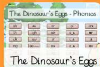
Spell words using phonics