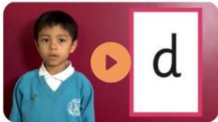
Phase 2 sounds taught in Reception Autumn 1

https://www.littlewandlelettersandsounds.org.uk/resources/for-parents/