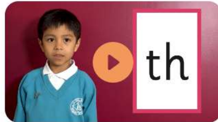
Phase 2 sounds taught in Reception Autumn 2