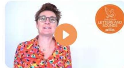
How to say Phase 5 sounds