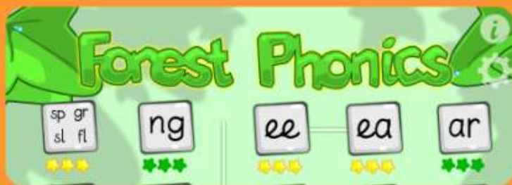
Spell words using phonics

http://www.ictgames.com/mobilePage/literacy.html