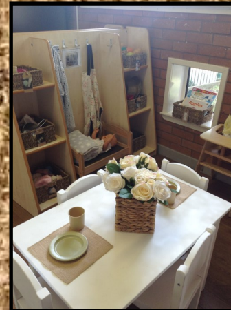
Our home corner