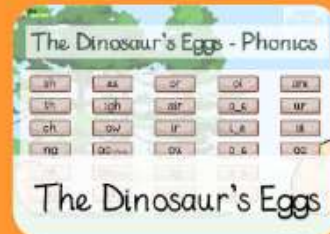
Spell words using phonics