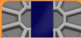
Look, Cover, Write, Check