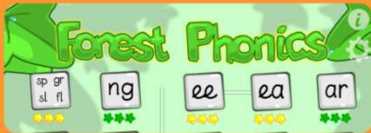
Spell words using phonics

http://www.ictgames.com/mobilePage/literacy.html