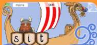
Viking Full Circle