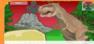
Tell A T-Rex