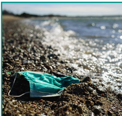
Face Masks Litter Beaches