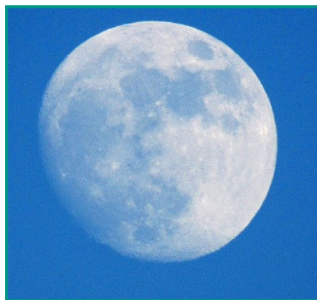
Scientists Pull Moon Closer to Earth for Brighter Nights