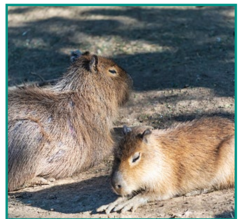
World's Largest Mouse Found and It's as Big as a Horse!