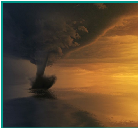
Tornado Hits South America