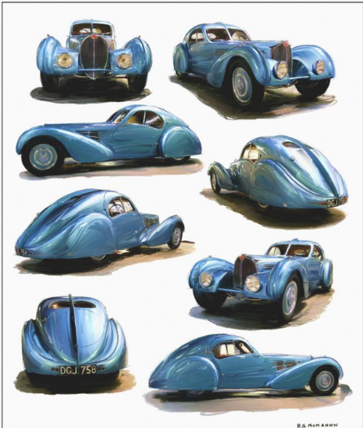
1936 Bugatti Atlantic Type 57 SC