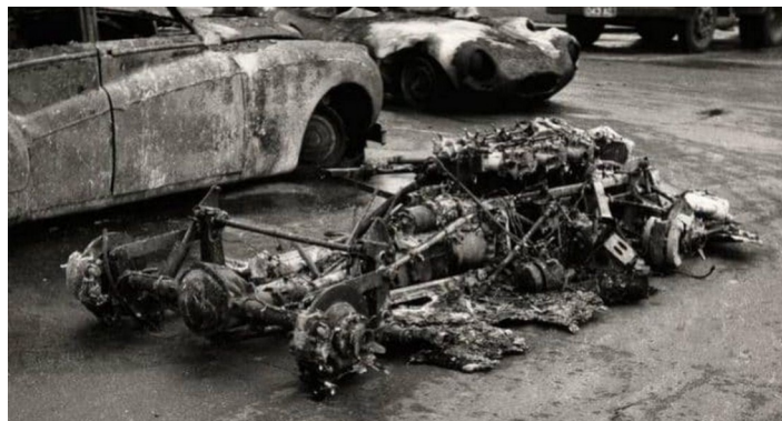
Wreckage of a XKSS

By early 1957 a total of 16 of the planned production run of 25 XKSS's had been completed at Jaguar's Browns Lane plant. On the evening of 12 February a fire broke out, destroying the remaining nine XKSS's in mid-production, along with several hundred other cars.