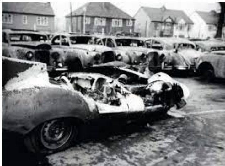
Burned out D-Type

All of the destroyed XKSS's had been destined for North America. Most of the previously built 16 XKSSs were also sold in the US.