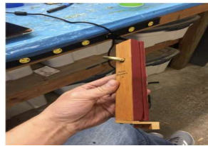
The same stop switch releathered and ready for installation.

Work on this final phase of the organ's restoration would commence in the spring of 2024. Removal of all parts on site would start after Easter of next year, which is March 31; therefore, dismantling of the organ could happen as early as April 2, 2024. The organ will be out of commission and not playable for several months, post Easter and into Pentecost. The releathering process could take up to 3 months in the Builder's workshops. The re-installation of all removed parts would happen in August of next year, followed by an extensive tuning. Payments to the Builder, being Casavant Freres, are required upon: (1) signing of the contract or 'memo of agreement', which happened on November 30 th , 2023; (2) dismantling of the organ and removal of all parts from the church; (3) when all parts have been repaired, worked on and are ready for shipment from the Builder's workshops back to Zion; and (4) after the re-installation and a full tuning are completed.