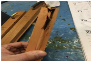
A 1960's stop control switch (not from Zion's organ) showing the tears that have developed, rendering the entire stop dead.