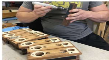
Reassembling the finished Casavant Primary blocks with all new gaskets, valves, and pneumatic leather.

In the New Year an Organ Restoration Committee will be formed, and fund-raising initiatives will be planned, possibly including an organ recital, and hopefully a Spring Fling Festival of Music, much like the special Festival of Music concert held in November, that celebrated Zion's 140 th Anniversary. Please feel free to ask whatever questions you have, or if I can better explain any of the technical details and restoration work that will be performed. Anyone and everyone is always welcome to join me up at the organ. Have you ever sat upstairs or wondered what it's like to hear or feel the organs presence in the balcony? You might even see some funky socks at the organ bench. Thank you to the people of Zion for your continued support of the organ, and our Music Ministry.