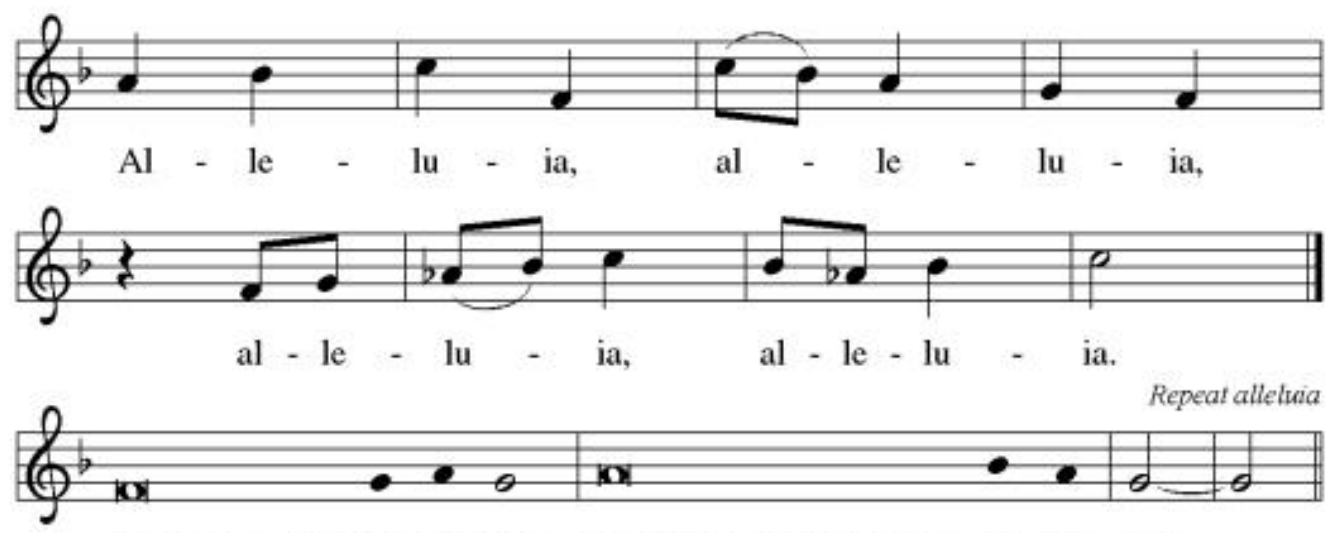
Lord, to whom shall we go? You have the words of e-ter-nal life.