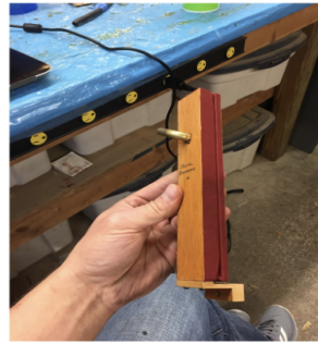
The same stop switch releathered and ready for installation.

Work on this final phase of the organ's restoration would commence in the spring of 2024. Removal of all parts on site would start after Easter of next year, which is March 31; therefore, dismantling of the organ could happen as early as April 2, 2024. The organ will be out of commission and not playable for several months, post Easter and into Pentecost. The releathering process could take up to 3 months in the Builder's workshops. The re-installation of all removed parts would happen in August of next year, followed by an extensive tuning. Payments to the Builder, being Casavant Freres, are required upon: (1) signing of the contract or 'memo of agreement', which happened on November 30 th , 2023; (2) dismantling of the organ and removal of all parts from the church; (3) when all parts have been repaired, worked on and are ready for shipment from the Builder's workshops back to Zion; and (4) after the re-installation and a full tuning are completed.