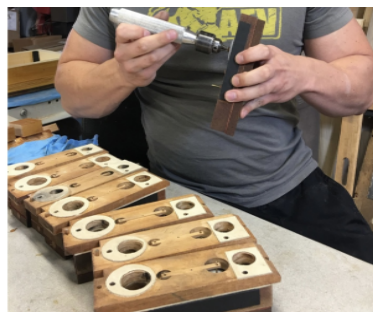
Reassembling the finished Casavant Primary blocks with all new gaskets, valves, and pneumatic leather.