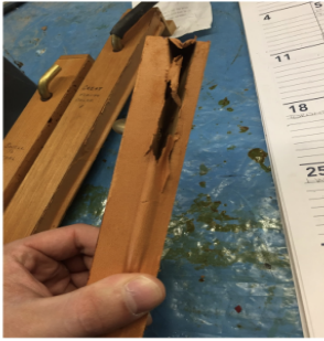
A 1960's stop control switch (not from Zion's organ) showing the tears that have developed, rendering the entire stop dead.