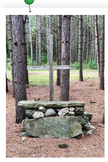
IN THE PINES