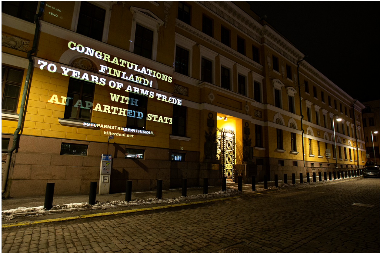
Finland's Ministry of Defense headquarters on March 30th, 2023.