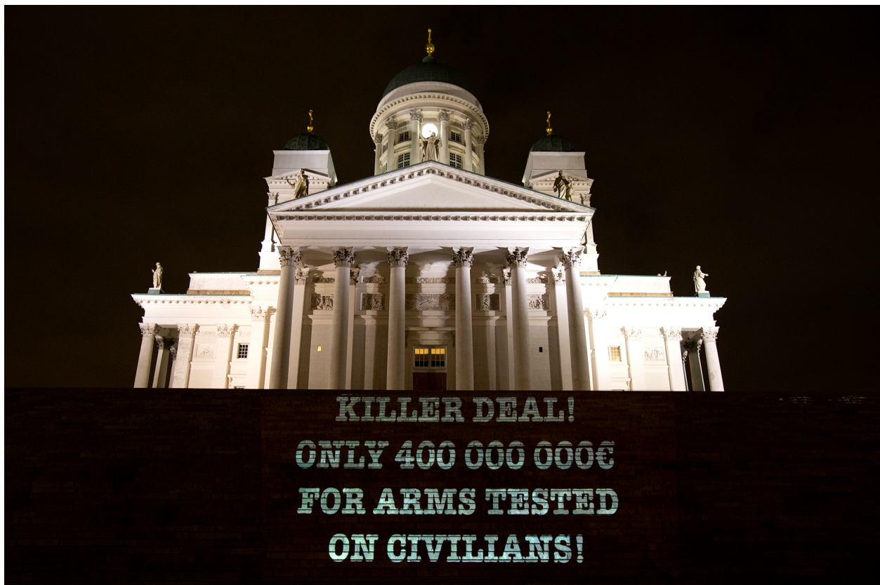
The Helsinki Cathedral on March 30th, 2023.

During the past decade, Israel has moved from apartheid towards fascism. The current Finance Minister Bezalel Smotrich defines himself as a " fascist homophobe ". As hundreds of thousands of Israelis have risen to protest against fascism, the Finnish government continues with its plans to buy hundreds of millions of euros worth of missiles from Israel, supporting apartheid.