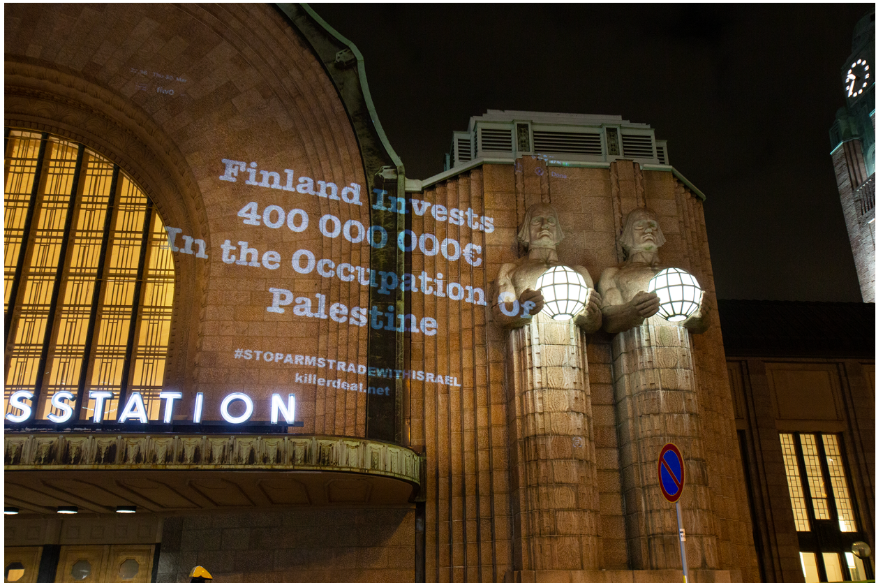
The Helsinki Central Railway Station on March 30th, 2023

The General Election is held on Sunday the 2nd of April, 2023.