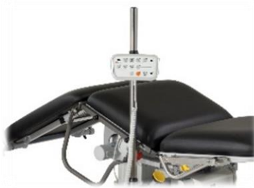
140-00238-02 Fixed, bracket included

Rotatable on flexible bar and is mounted with clamping bracket on the wheel frame