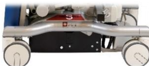
140-00266-01 Electrical brake and direction control

Makes the table go automatically to the desired position with one touch of button 1-4, Trend or Level-0.