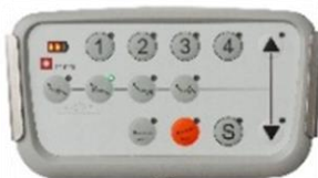
140-00261-01 Auto access to memory location

Makes the table go automatically to the desired position with one touch of button 1-4, Trend or Level-0.