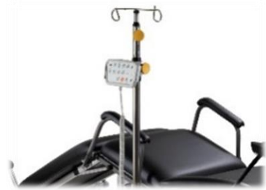
140-00238-03 Fixed for IV-pole, bracket included

Fixed to bar and can be rotated and adjusted vertically