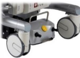
140-00230-01 Foot control with two joysticks movable tray

With four functions: Height, backrest tilt, rotation and leg support tilt or electrical headrest (if electrical headrest option chosen). Allows the surgeon to make fine adjustments during surgery.