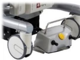
140-00230-02 Foot control with two joysticks fixed tray, can't be combined with electric headrest

Placed on extendable tray or can be placed on the floor