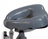
140-00270-06 Pillow for FaceDown/FaceUp Moulded, soft pillow both for facedown or faceup surgeries