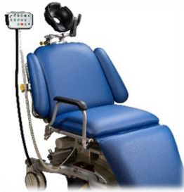
140-00238-01 Flexible, bracket included

Rotatable on flexible bar and is mounted with clamping bracket on the wheel frame