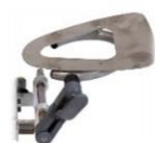
140-00252-05 Headrest FaceDown/FaceUp Tray that allows the patient to lie on the stomach or the back