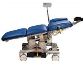
140-00352-00 Reverse Trendelenburg max 12°

Brake and direction control is operated by the hand control instead of the brake pedal, increases space next to the chassis. Can't be retrofitted