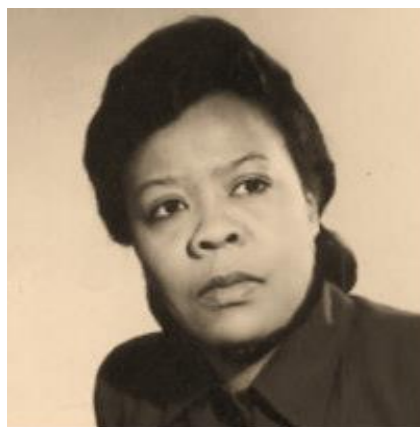
Marie Van Brittan Brown October 30, 1922 – February 2, 1999

Clerk: 815.937.1200 Treasurer: 815.401.5270 Garbage: 815.523.7452 Bldg. Inspector: 815.937.9121 RJB CC: 815.304.4498