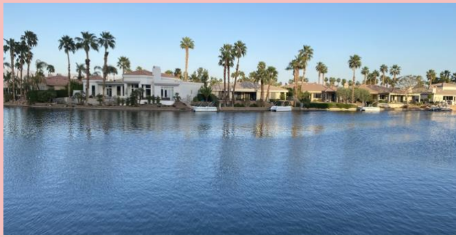
Lake La Quinta view from Mélange

Old Town La Quinta – Old Town has many shops and restaurants that are walkable. Some of the restaurants that we have enjoyed include