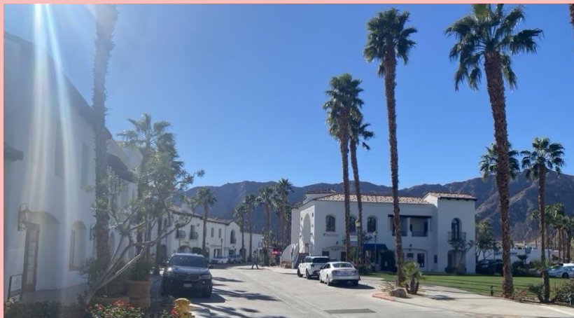
Downtown Old Town La Quinta