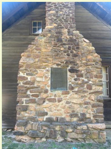
Chimney – Bennett House