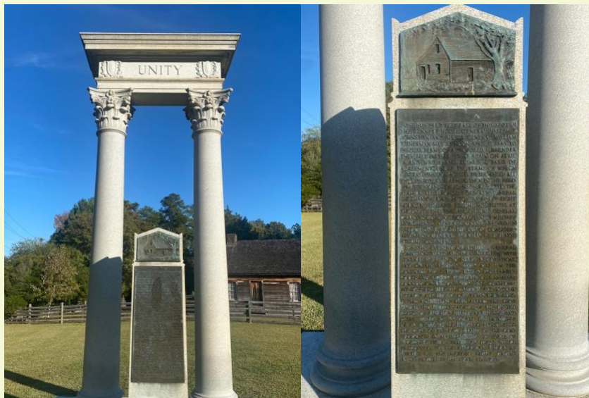
Unity Monument dedicated on October 12, 1923