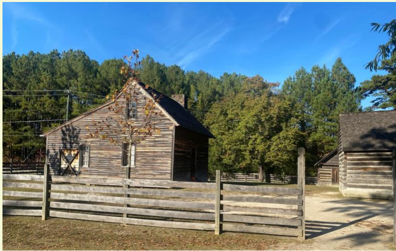
Bennett House on the left, Kitchen on the right and Smokehouse left of Kitchen