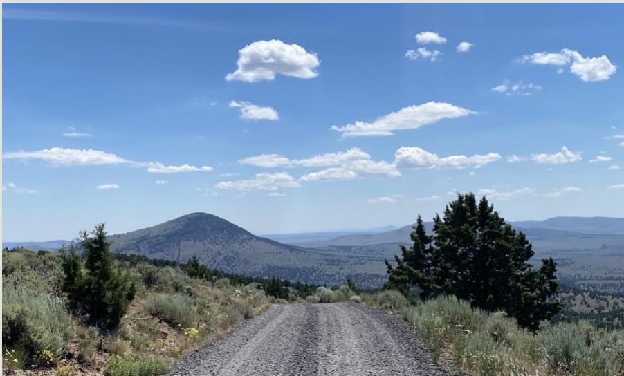
Road with obsidian with Little Glass Butte in background