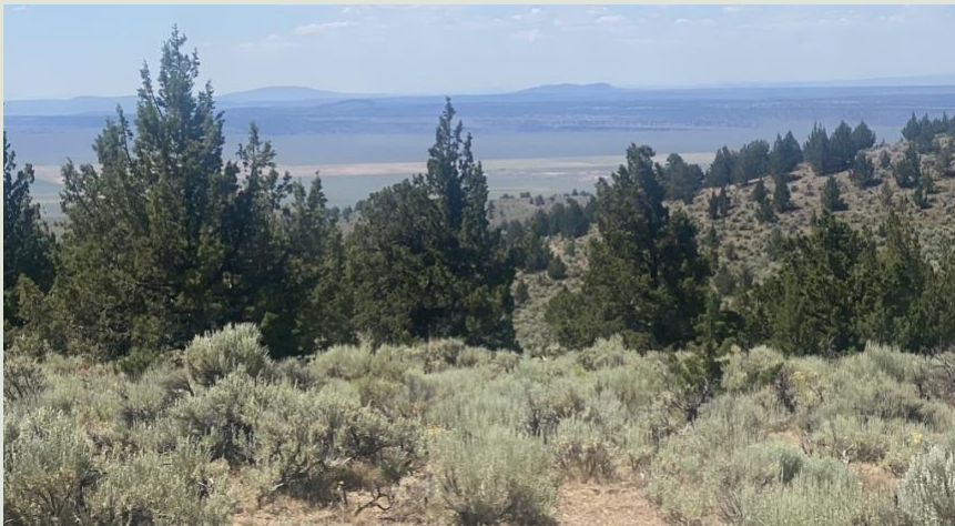
Looking south towards Christmas Valley. Fort Rock in the background (middle of picture)

Glass Butte is in the north portion of Christmas Valley, which has various sites worth visiting, such as Fort Rock, Crack in the Ground, and Sand Dunes. Our write up on Central Oregon includes more information about those sites.