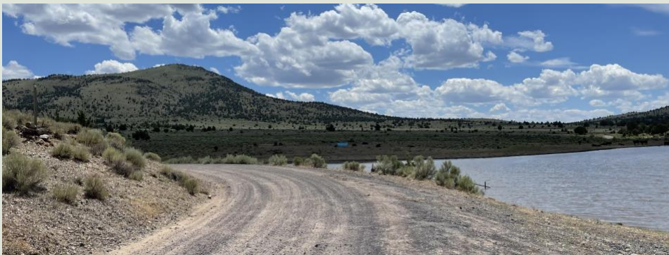
Road, Pond, and Glass Butte

We visited during the summer, and it was hot. Because of the high altitude ranging from 5,000 to 6,400 feet, the sun's rays are very intense. Sunscreen, bug repellent, and sturdy hiking shoes are a must for this visit. For obsidian collection, please bring gloves, as the obsidian is very sharp. We wished we had brought a bucket to carry the obsidian.