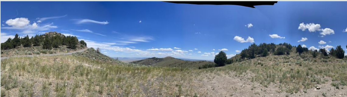
Top of Glass Butte on left