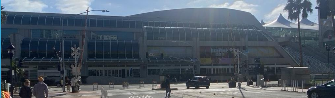
Front Entrance to San Diego Convention Center

Convention Center –We have attended conferences at the San Diego Convention Center as well as the hotels nearby. The area around the convention center can be busy. We recommend a visit to the convention center area, the marina facing the bay, and the Gaslamp Quarter across the street.