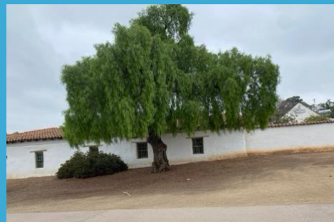
Tree on side of Casa

A site that I didn’t have time to visit but is worth visiting is the Whaley Haunted House , as it is dubbed as America’s most haunted house.