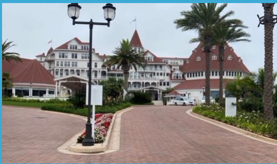
Entrance to the Del