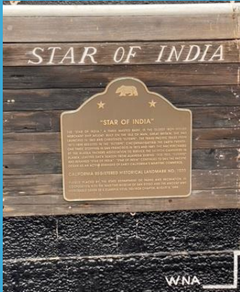
Star of India Plaque

named Euterpe from 1863 to 1906. The ship has been known as Star of India since 1906.