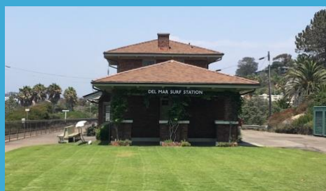
Del Mar Train Station

Solana Beach is north of Del Mar, and we like getting a bite to eat at Tidewater Tavern , which is a sports pub. The atmosphere is very laid back.