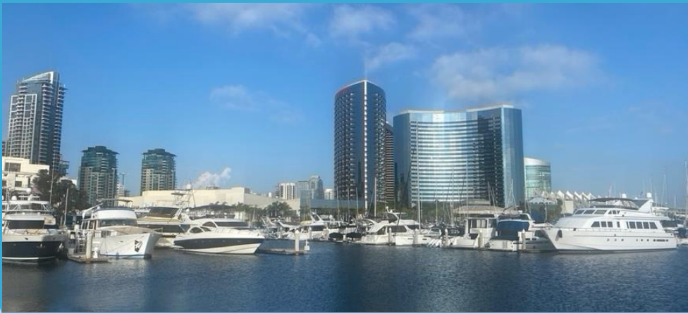
View from the Marina