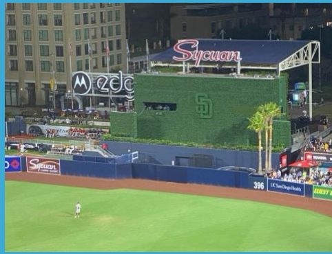
Views of the ball game and stadium