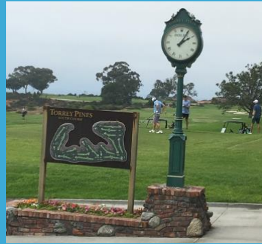
Golf Course Information