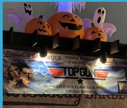
Kansas City BBQ also home to filming location for Top Gun