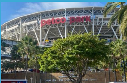
Petco sign on the ballpark