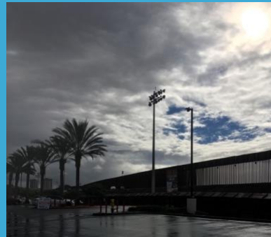
Border wall at Las Americas Premium Outlets