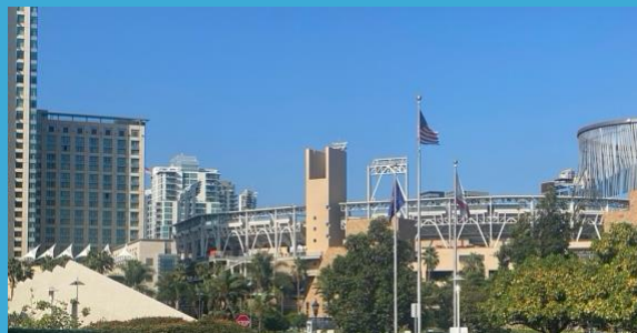
Ballpark view from East Harbor Drive