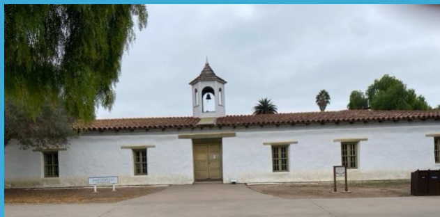
Entrance to Casa de Estudillo