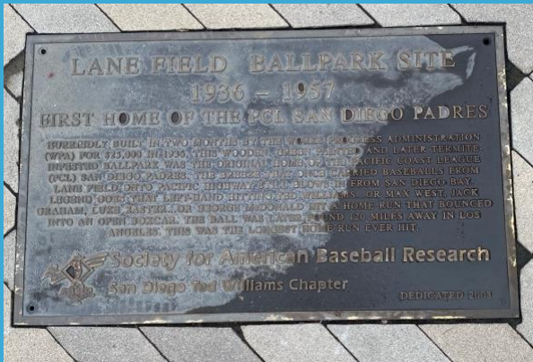
Plaque (needs cleaning)

landed in a railroad car bound for Los Angeles. (The area behind right field used to be a train depot, and active train tracks remain in the area.) The Los Angeles maintenance crew later found the baseball as they were maintaining the railcar. I wanted to ask him if he was a fisherman ... but he was helping in maintaining history, so I said, "wow, I didn't know that! and thanked him for the trivia. The smile on his face was priceless.