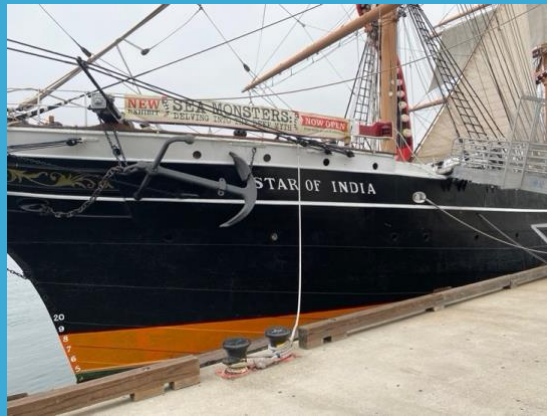
Star of India at the Wharf