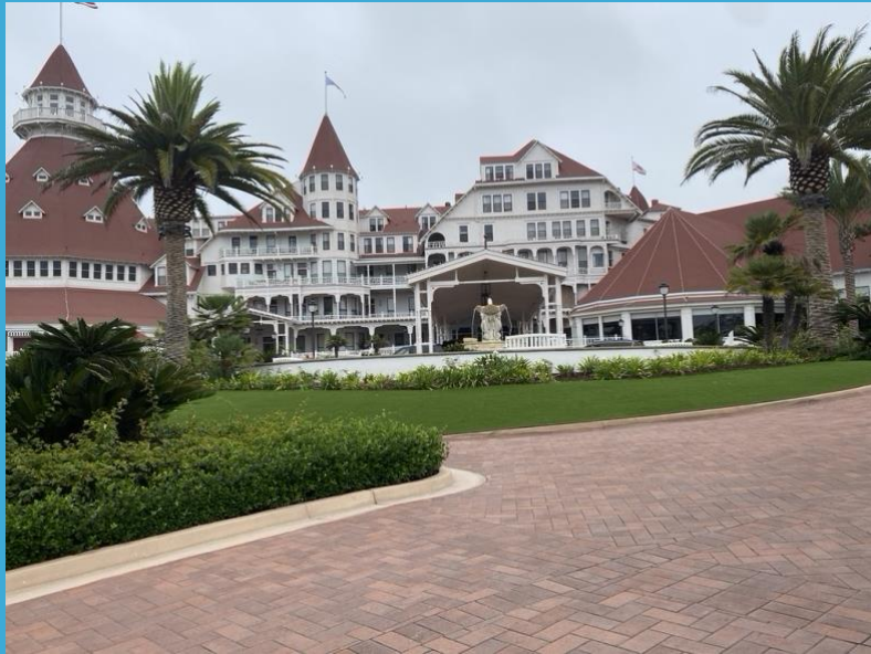
Entrance to the Del