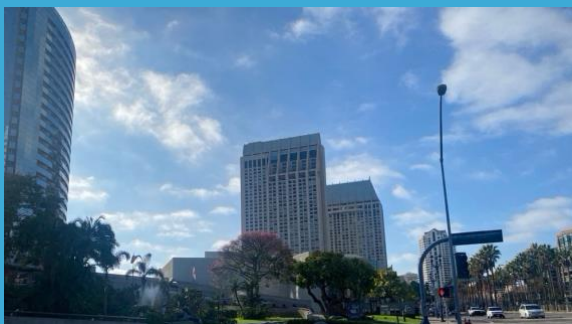
View from E. Harbor Street