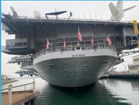
USS Midway Museum

men from every conflict listing to Mr. Hope's performance.