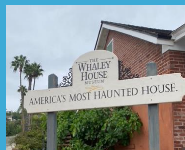
Sign at Whaley House