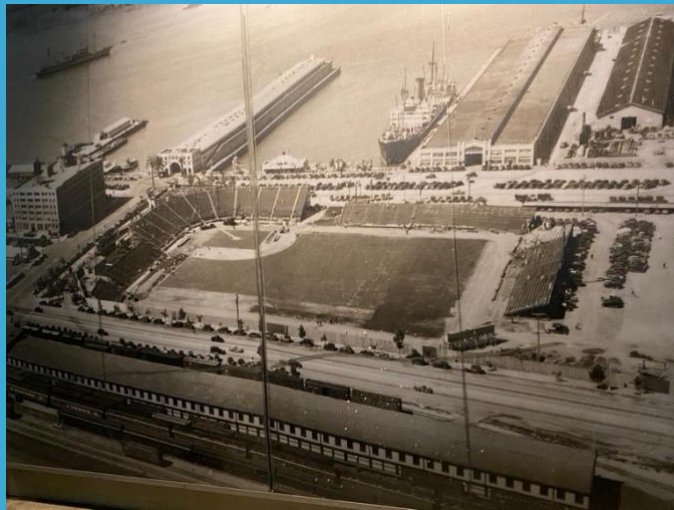
Picture of Lane Field

Union Station (pictured below), also called Santa Fe Depot, is a couple of blocks northeast of USS Midway Museum on W. Broadway and a block east from the old site of Lane Field.