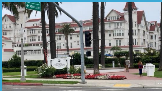
View of Del from Orange Avenue