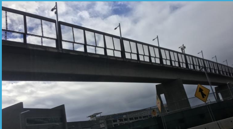
Bridge at San Ysidro