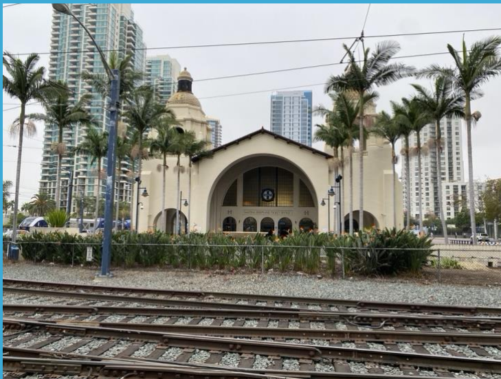
Santa Fe Depot

Union Station (pictured below), also called Santa Fe Depot, is a couple of blocks northeast of USS Midway Museum on W. Broadway and a block east from the old site of Lane Field.