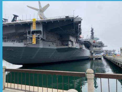
USS Midway Museum