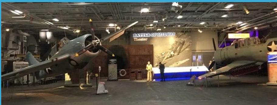
Inside the USS Midway Museum