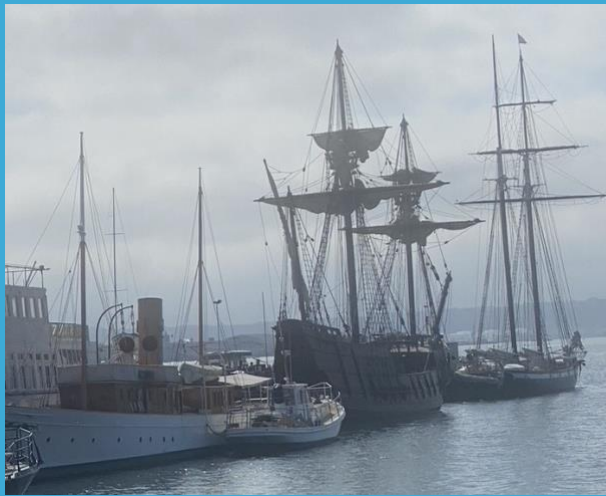
Replica of San Salvador, Cabrillo' flagship (2nd ship in picture)