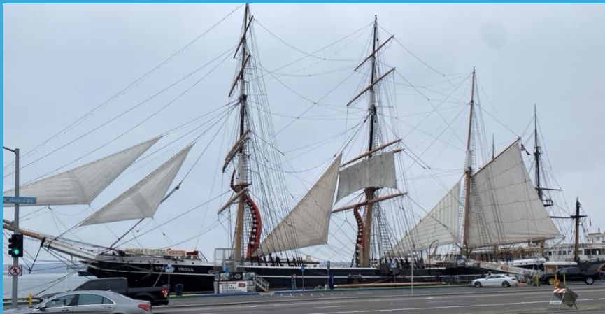
Star of India at the Wharf

The museum also has a replica of a San Salvador galleon from Juan Rodriguez Cabrillo's expedition that landed in Point Loma.