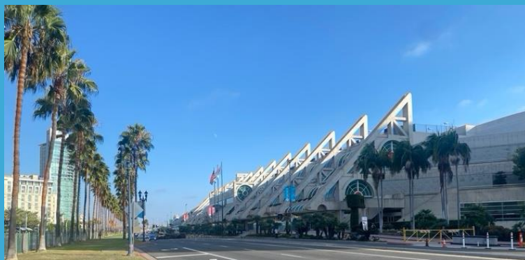
San Diego Convention Center