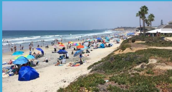
Del Mar Beach