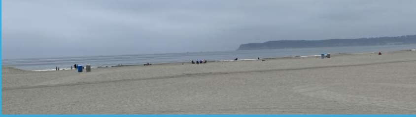
View of the Beach