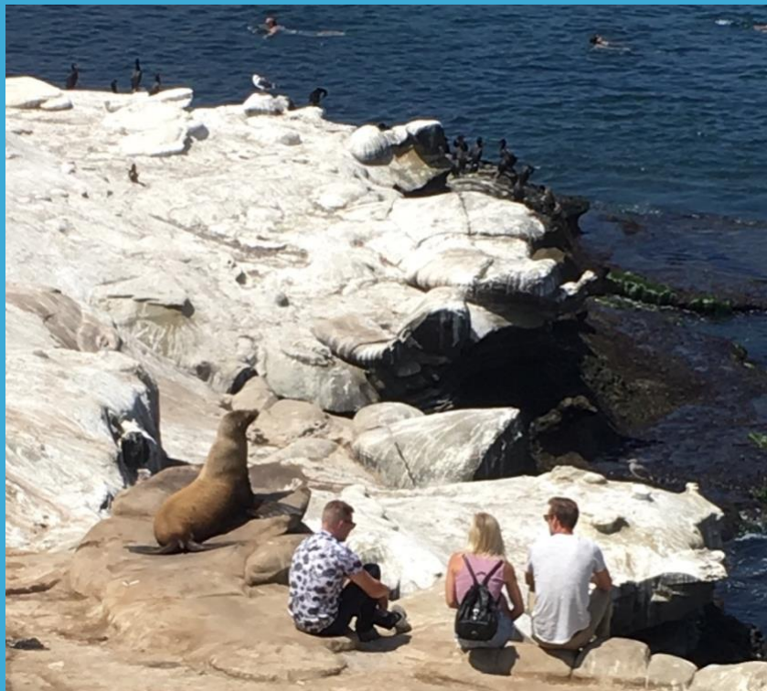
What story is the Sea Lion telling?