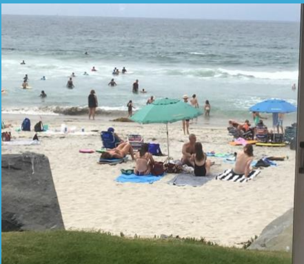
View from a table at Jake's