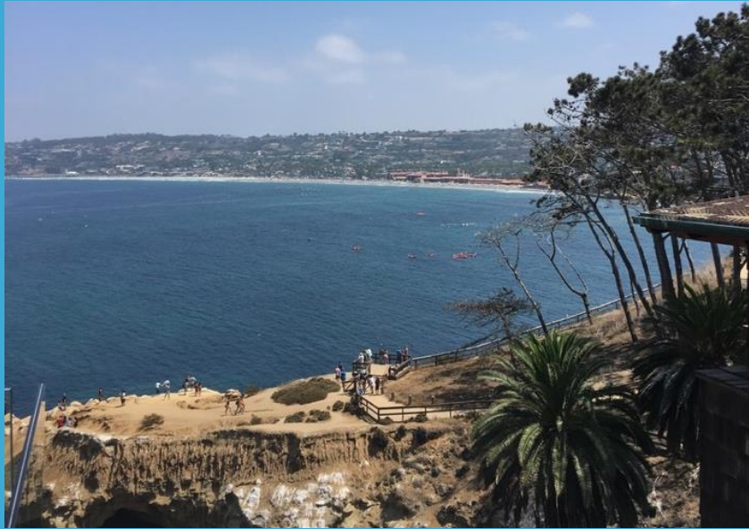
View from Point La Jolla

rooftop seating, the views are spectacular, and a bonus is you can see the sea lions and seals.