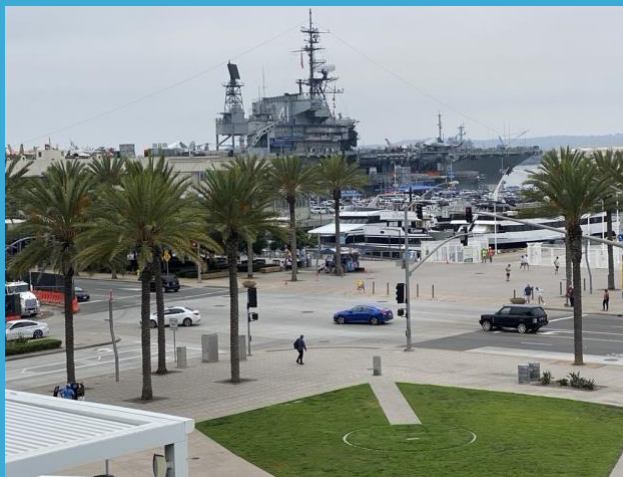
View from the pitcher's mound