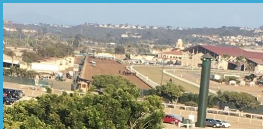
Thoroughbred racing at Del Mar