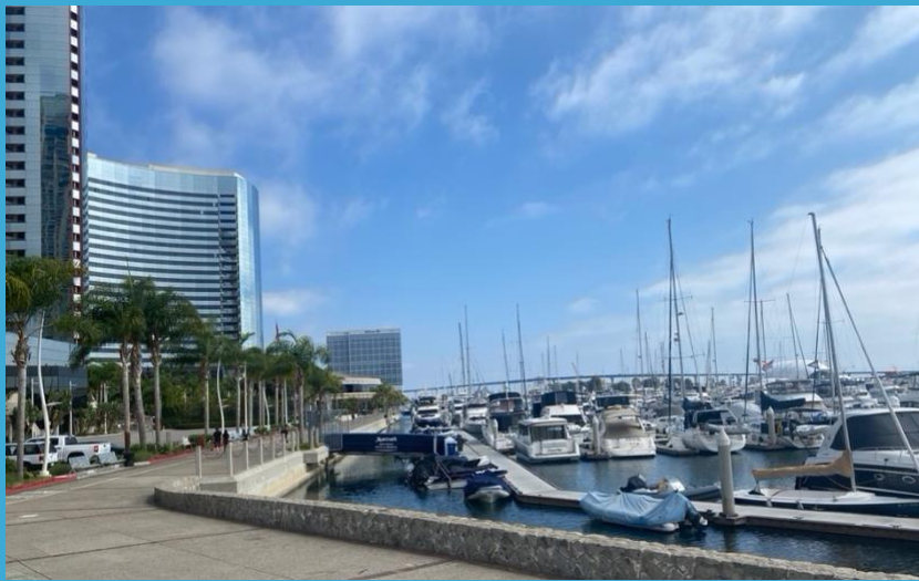
View from the Marina