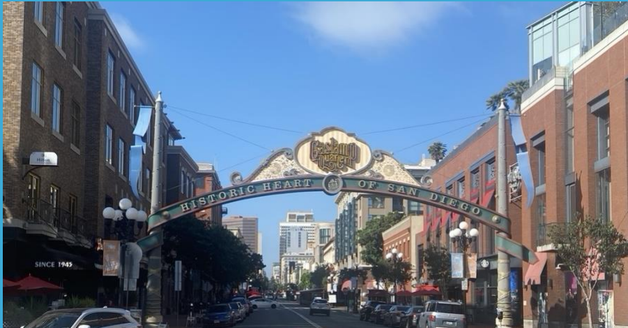
Entrance Sign to Gaslamp Quarter

Island Avenues. The building has a Victorian architecture and worth visiting. The current Gaslamp District has lot of restaurants, bars, and hotels. We thought the prices for eating out at Gaslamp are high; check the prices on the menus outside before committing. There are many historic buildings in Gaslamp. (For our East Coast friends, we know “historic” is all relative; historic in California is anything from the late 1800s and early 1900s.