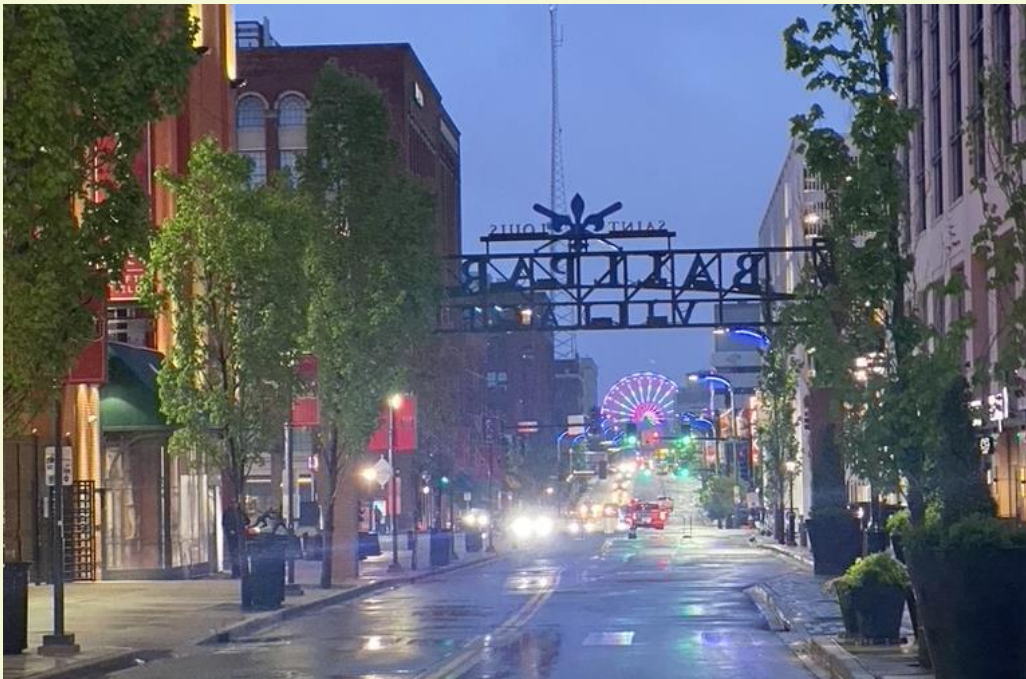
View of St. Louis wheel from Ballpark Village

We left the watch party area and went to a restaurant/bar in the village to watch the rest of the game. The Blues fans who were there echoed the same sentiment from the watch party: Who should be the starting goalie for game 4?