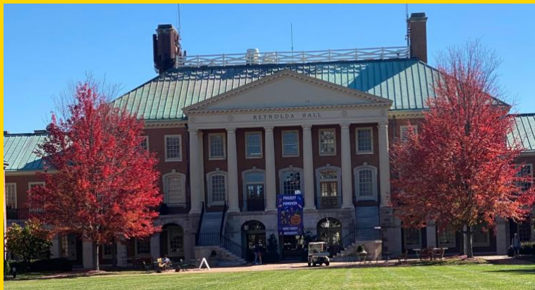
Reynolds Hall – Administrative Offices