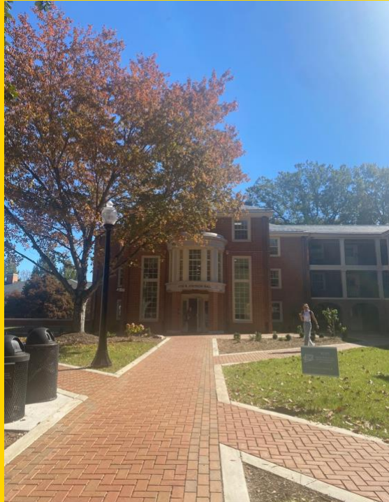
Johnson Dorm on South Campus