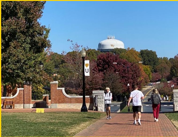
Water Tank with Wake Forest Logo