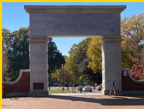
An entrance to the Quad