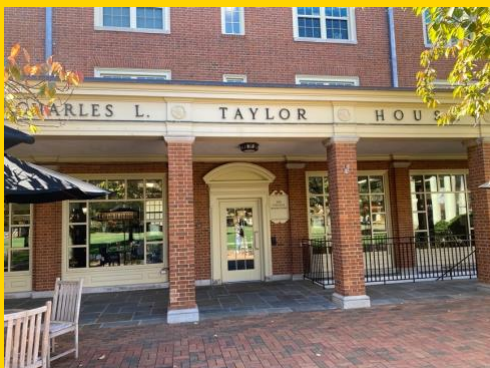
One of the Bookstores