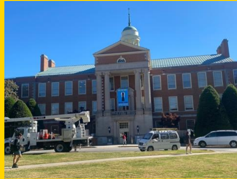
Manchester Plaza and Reynolds Hall in the background Z. Smith Reynolds Library

A Wake Forest tradition is to “roll the Quad,” or draping trees in the quad with toilet paper after a Wake football or basketball team victory. Until recently, Wake Forest was not very successful in football. Recently, Wake has fielded competitive teams, and the quad gets a lot of toilet papers on the trees. We saw remnants of that tradition when we visited.