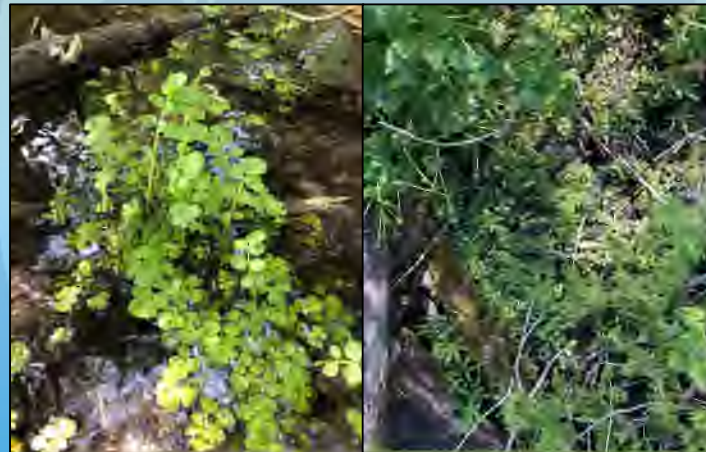
Potential Cut-Leaved Water-Parsnip – G2