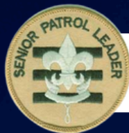
SENIOR PATROL LEADER