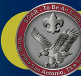
SHARED Equipment Coordinator