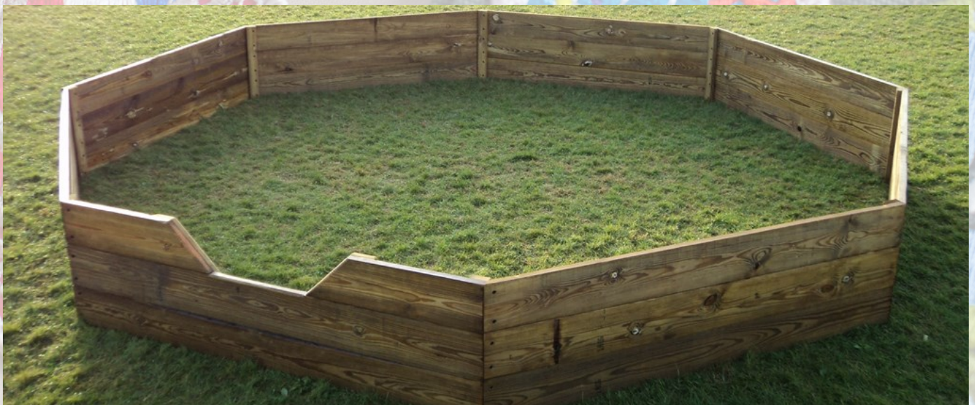
Ga-Ga Ball Arena aka. "The Octagon"

Scouts gathered on Saturday morning to set up pop ups, tables and chairs to showcase their respective Troops for the fall Troop Open House. With a Ga-Ga Arena for play, Scouts played the game with visiting youth that combines dodging, striking, running, and jumping, with the objective of being the last person standing. Scouts prepared and served chili dogs, Frito-pie and cold lemonade to visitors as they spoke about their achievements and fun experiences in Scouting.