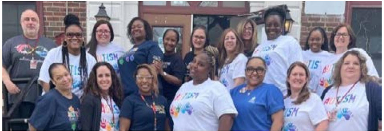
RTES Autism Awareness Day