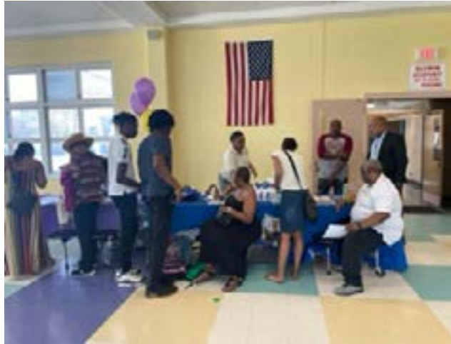
CALW Community Event at MVHA