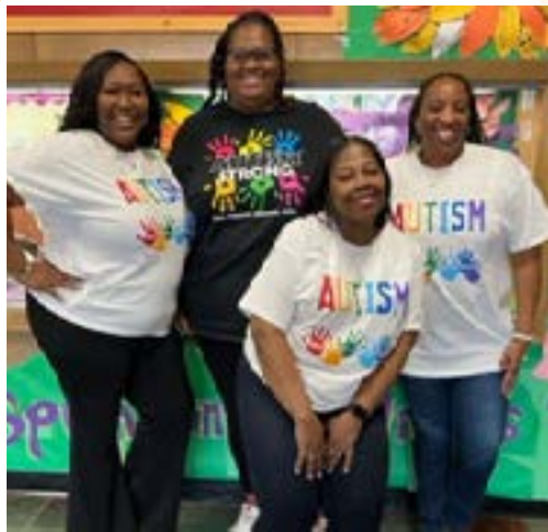
MVHA Autism Awareness Day