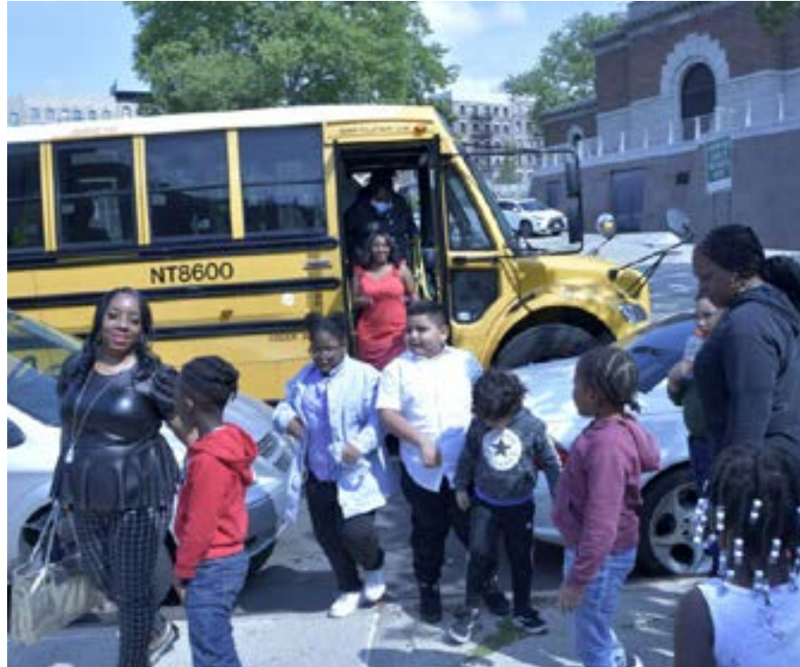
MVLA Students and Staff Arrive at City College for Performance