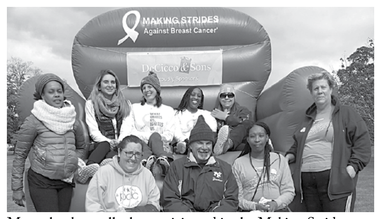
Many thanks to all who participated in the Making Strides Against Breast Cancer fundraiser. MVFT collected $11,000!

Dental exams and cleanings are allowed two times within a twelve month period.