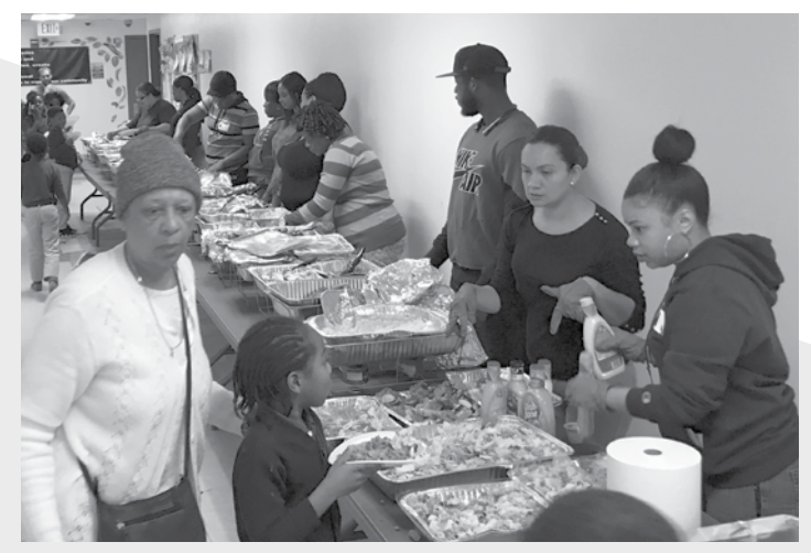
Hamilton Elementary "Gobble Until You Wobble" Feast for both staff and students, held on November 20, 2018.

Rebecca Turner Elementary School continues to raise awareness with bullying prevention activities. Students, staff, and parents participated in "Mix It Up at Lunch Day." Students were encouraged to sit with and talk to someone they did not know or someone they had never interacted with before during lunch. Participants wore a black shirt to show unity in taking a stand against bullying and unkind acts of intolerance!