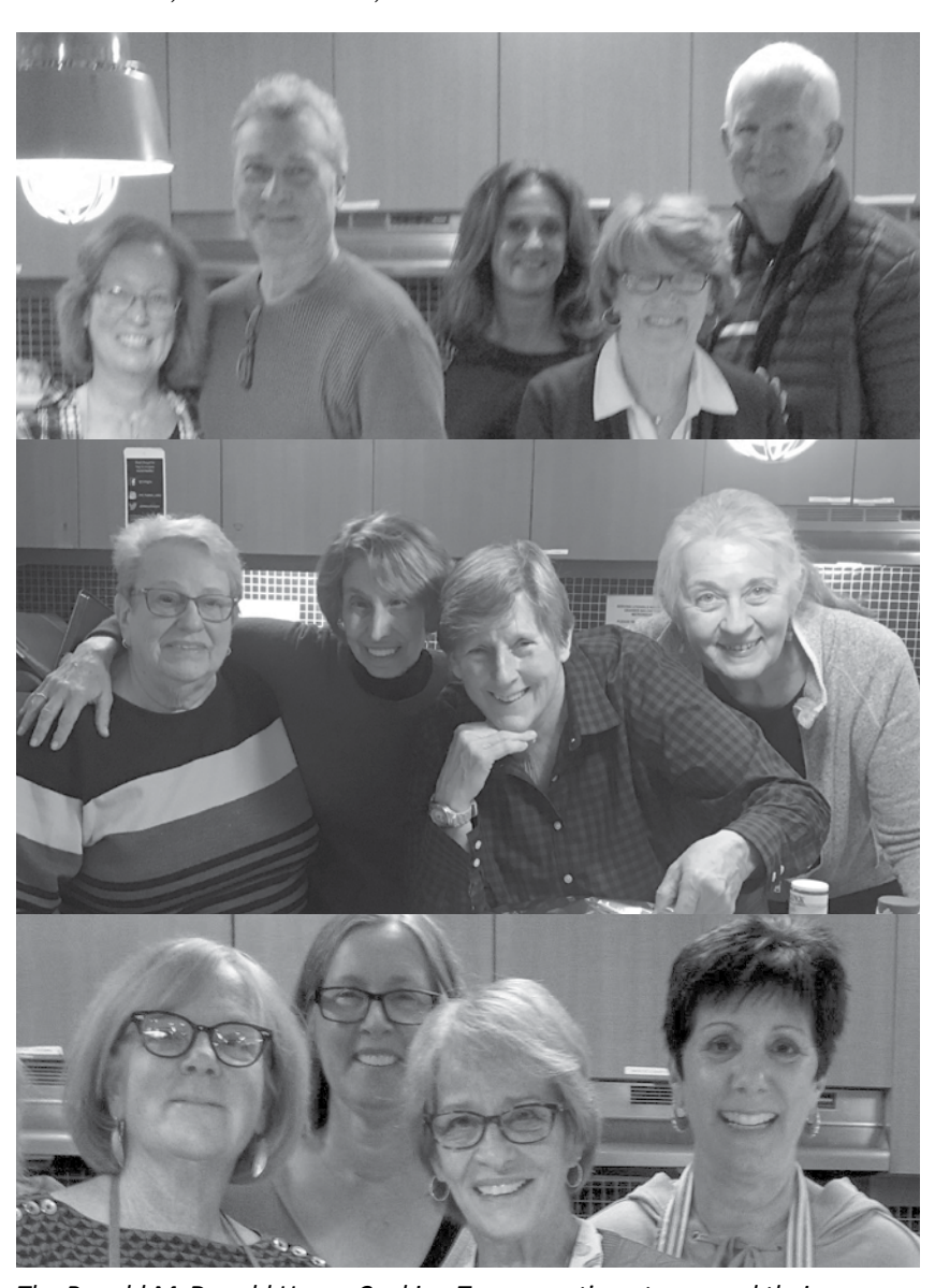
The Ronald McDonald House Cooking Teams continue to expand their menus with delicious meals prepared with love.