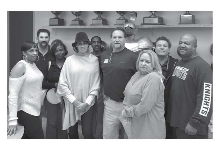
SRP Day at MVHS

The office will be closed between July 29th and August 2nd and will reopen on Monday, August 5th.