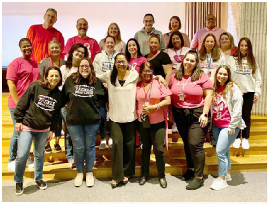
Lincoln togetherness in Making Strides Against Breast Cancer and wearing pink!

The Mount Vernon teachers would like to express their sincerest gratitude for all the teaching assistants and security guards in the district that come to work every day working with our students with enthusiasm, pride and keeping our students safe. The positive attitude that you bring daily into our classes and in the hallway motivates the students to learn and grow. We are thankful to the teaching assistants that are always willing to be a team player and support all the scholars in the schools. We appreciate the teaching assistants that work collaboratively with the classroom teachers. Thank you for always being a lifelong learner, willing to learn and try all the new strategies presented in class and on professional development days. Thank you for all you do. Keep up the amazing work.