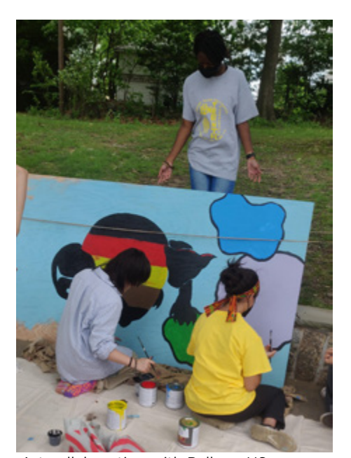
Art collaboration with Pelham HS