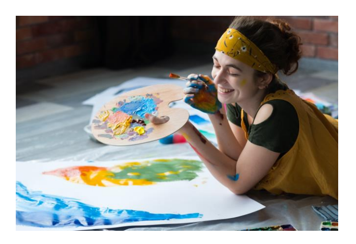
Express your creativity & helps other to express theirs!