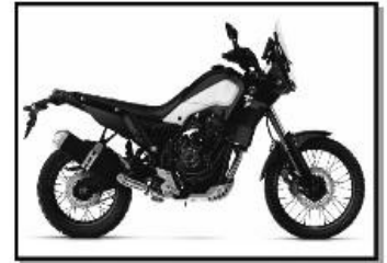
YAMAHA TENERE 700 COMING SOON!

NOW TAKING DEPOSITS FOR THE ALL NEW TENERE 700