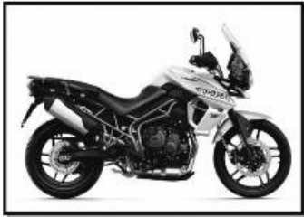
TRIUMPH TIGER 800-1200cc