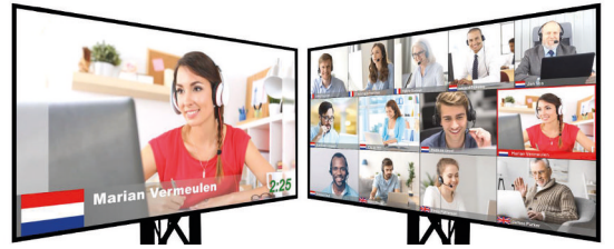
Mosaic view of participants and results