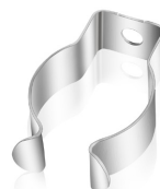
Stainless steel clip