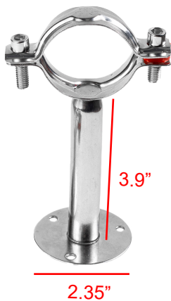
D . Stainless steel clamp