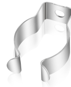
Stainless steel clip