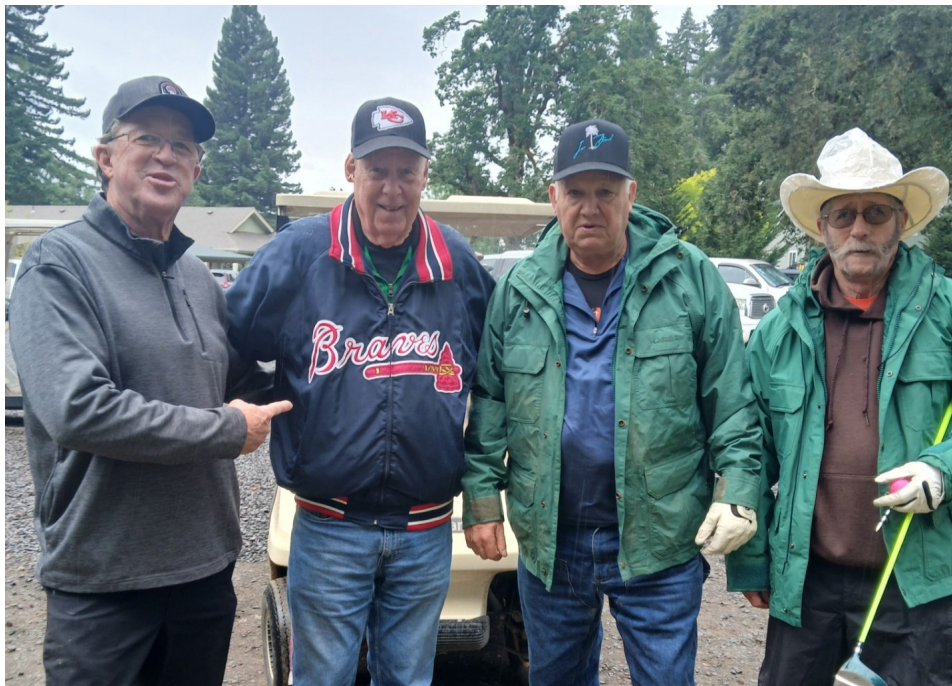
Section 8 golf team who competed in the Golf Tourney

The tournament was a big success, over $4,000 was raised this year. There were 15 teams that competed. A HUGE thank you to all our sponsors and contributors.