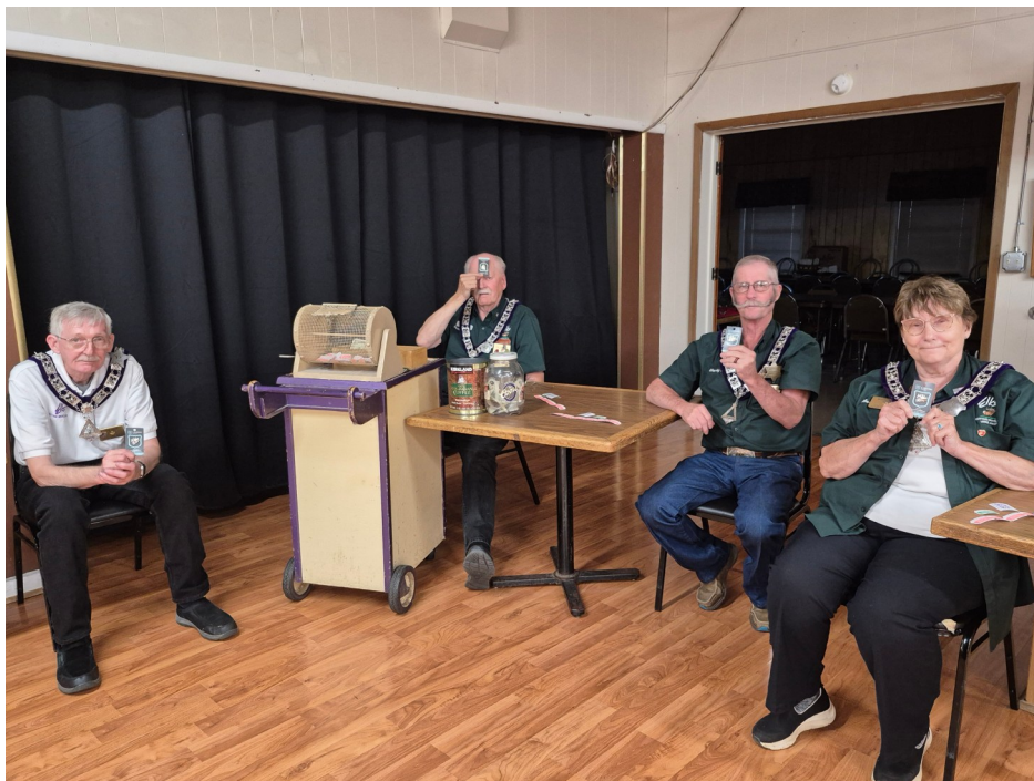
The Trustee group showing the Elk enamel pin from the ER