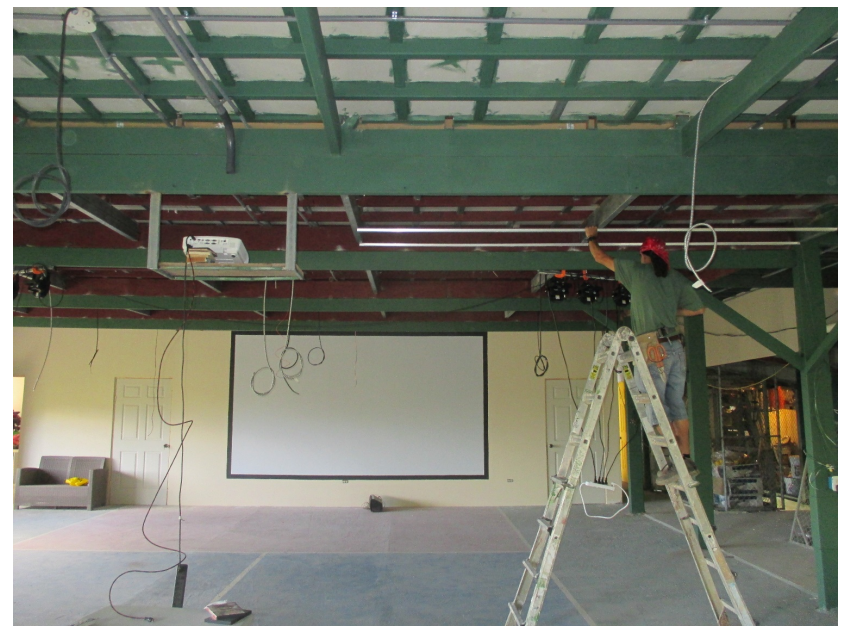
9'x 16' Big Screen