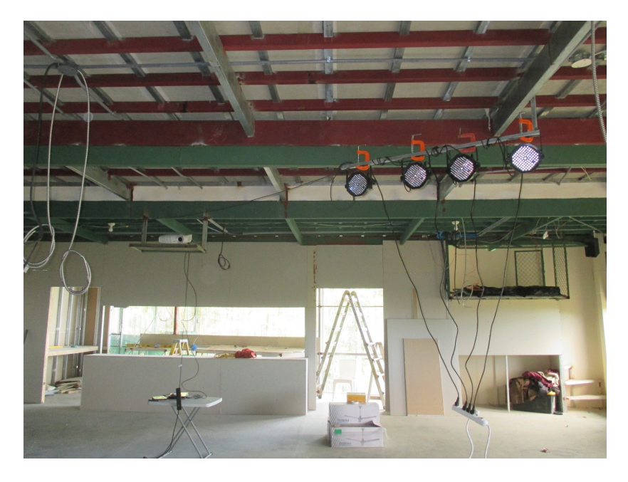
Kitchenette on right, sound and light tower on left, theater lights in foreground